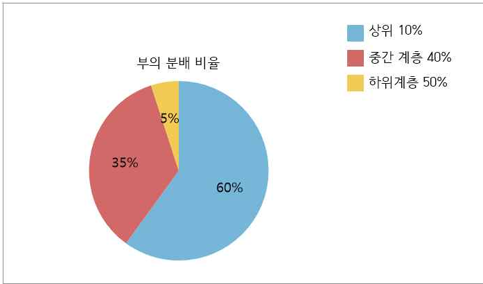
〈표 1〉 시대별 지역별 자본소유의 불평등 30)