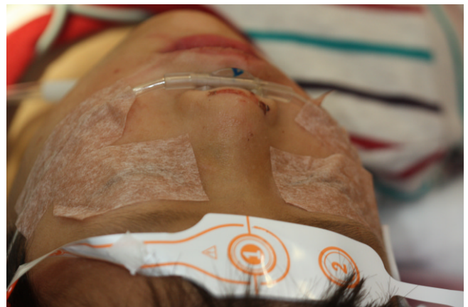
Fig. 2. Patients with nasal cannula and sensor of S/5 Entropy ™ Module.

Amoxicillin, 650 G, oral, administered 1 hour prior to each dental treatment as a prophylaxis to bacterial infection, and 8 vol% inspired sevoflurane gas administered using a full facial mask. After achieving loss of consciousness, the facial mask was substituted with a nasal cannula (Softech BI-FLO ® Cannula 1844, Teleflex Inc., Pennsylvania, USA)(Fig. 2). This nasal cannula is composed of two parts, where one supplies the oxygen and sevoflurane and the other detects expired gas of the patient (Fig. 3). Sevoflurane vaporizer was set to deliver 100% oxygen at gas flow of 2.0 L/min. End-tidal sevoflurane concentration as well as patient's respiration through capnography line of the nasal cannula was monitored throughout sevoflurane insufflation sedation.