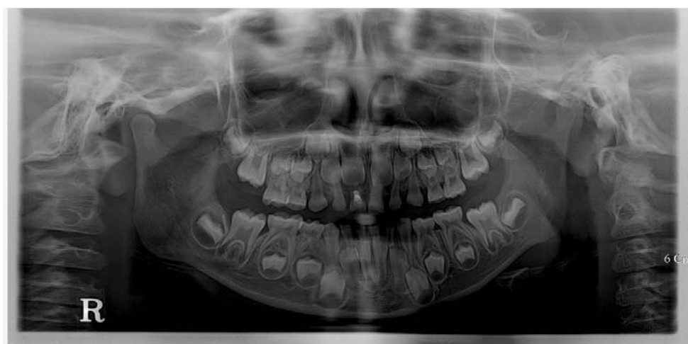
Fig. 1. An example of orthopantomography. The 7 left mandibular permanent teeth were staged and scored for dental age estimation.

by Demirjian and Goldstein in 1976. Nowadays this method applied in many countries and ethnic groups. The original method was based French-Canadian population. Many reports were announced about the validity of Demirjian's method based on their own population. Nystrom et al. (1986) found a more advanced dental maturation in Finnish children than the French-Canadian children and concluded that maturity standards must be based on studies made on the same population for which they will be applied. Mörnstad et al. (1994) concluded that the original studies gave an overestimation when used on a Scandinavian population. Koshy and Tandon (1998) founded that Demirjian's method gave an overestimation of 3.04 and 2.82 years in males and females, respectively and attempted to formulate new norms for the maturity score based on South Indian population.