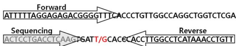
Fig. 1. Pyrosequencing assay design. PCR amplifies a 137-bp fragment containing KRAS let-7 lcs6 . The sequencing primer can detect polymorphism site (T/G).