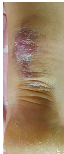
Fig. 3. The granulomatous mass was detected along the previous incision scar.

Deep infection occurred in 1 patient in the nonabsorbable suture group and absorbable suture group, respectively. All patients with deep infection were treated without any residual deficit by debridement and parenteral antibiotic therapy. Six months after surgery, one of the patients from the nonabsorbable suture group visited the outpatient clinic complaining pain and a gradually enlarging soft-tissue mass adjacent to the previous surgical scar of Achilles tendon repair. On physical examination, mass with morphological characteristic of a semi-mobile solid soft tissue (2 × 3 cm sized in diameter) was detected along the previous incision scar (Fig. 3). The infection parameters of laboratory data (C-reactive protein level, erythrocyte sedimentation rate and white blood-cellcount) were within normal limited. The patient was subsequently readmitted and underwent exploration and revision surgery.