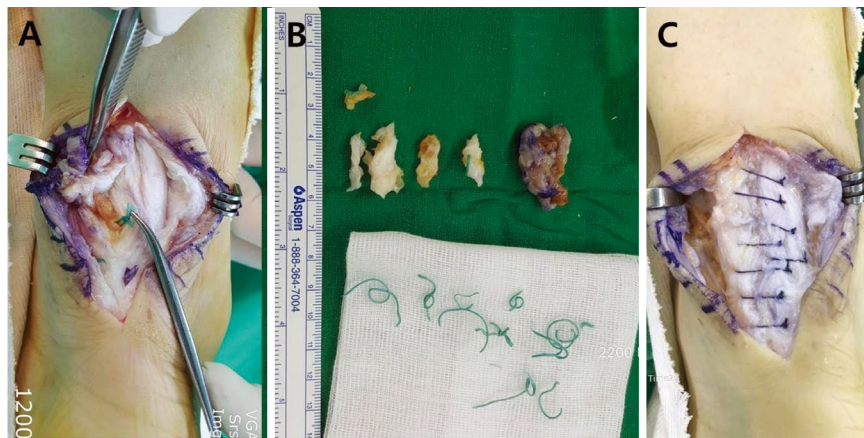
Fig. 4. Intraoperative findings in the patient with foreign body reaction. (A) Ethibond ® suture materials still remained on intact Achilles tendon after the granulomatous masses were excised, (B) All suture material remnants were removed, (C) A defect of Achilles tendon was restored by tubular repair using absorbable sutures.