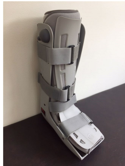
Fig. 2. Functional brace after the removal of splint.

All 20 patients were managed postoperatively with short leg splint immobilization for two weeks and started the tolerable weight-bearing in a functional brace (Fig. 2) at two weeks' follow-up. During the period of maintenance with a splint, the ankle was immobilized in a non-weight-bearing position of natural plantar flexion. After the pati-