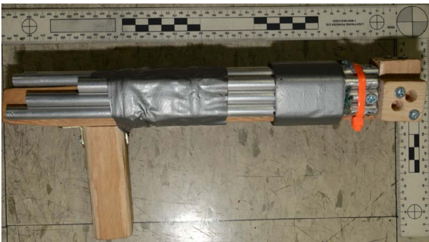
Fig. 1. Homemade firearm. Matchlock guns with multiple barrels (25-cm steel tubes) fastened to a wooden stock, which allowed multiple bullets (stainless-steel balls [6.75 mm in diameter]) to be fired simultaneously.

A gunshot entrance wound (approximately 7 mm in diameter) without an exit wound was observed in the left scapula