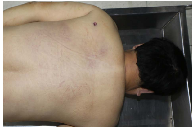
Fig. 2. Single gunshot entrance wound in the left scapula (approximately 19.5 cm below the external occipital protuberance and approximately 15.0 cm to the left of the axilla). No other significant findings were noted.

ula (approximately 19.5 cm below the external occipital protuberance and approximately 15.0 cm to the left of the axilla) (Fig. 2). No other significant findings were noted. Careful examination revealed an abrasion ring (approximately 2-mm thick) around the entrance wound (Fig. 3). There was no burning, blackening, or tattooing (from gunshot residue) of the surrounding skin. The wound characteristics suggest that the shot was fired from a distance of approximately 5 m. Chest radiography showed that the bullet