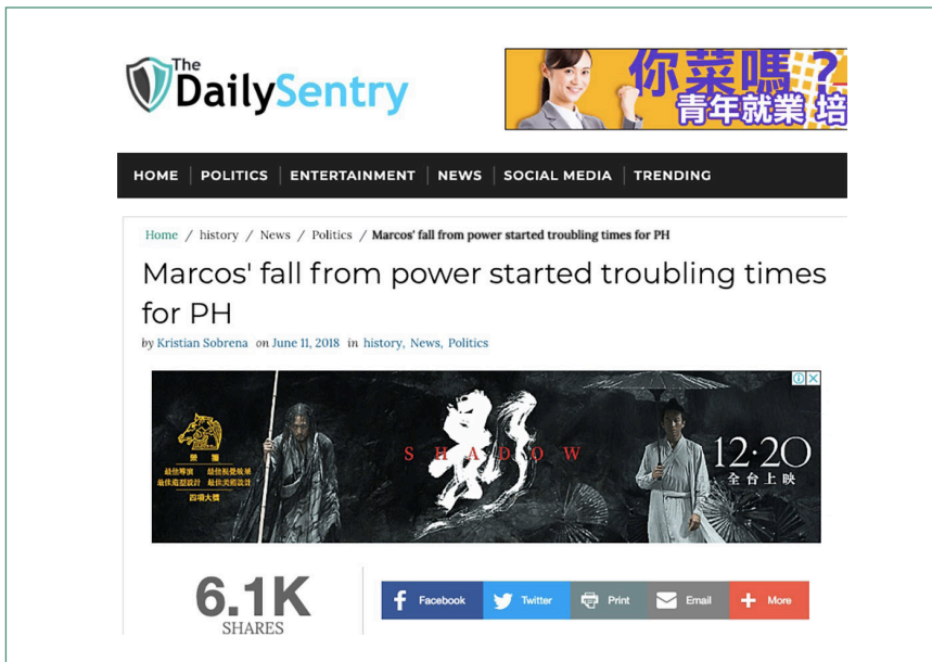
Figure 5 A misleading article from a blog site that uses a news-like interface. The author took the screenshot in 2018.

Based on my research on the true history of the Philippines, when martial law was declared, the Philippines experienced the most peaceful era... If you were law-abiding, you would surely not be scared to walk in the streets; you would not fear being mugged or experience any other crime, my friends.