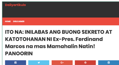
Figure 10 A 2016 click-bait video published in a news-like blog site. The title reads: “This is it: the whole secret and truth about ex-President Ferdinand Marcos that will make us love him more! Watch!” The author took the screenshot in 2018.

that were supposedly made ignorant by the yellows.