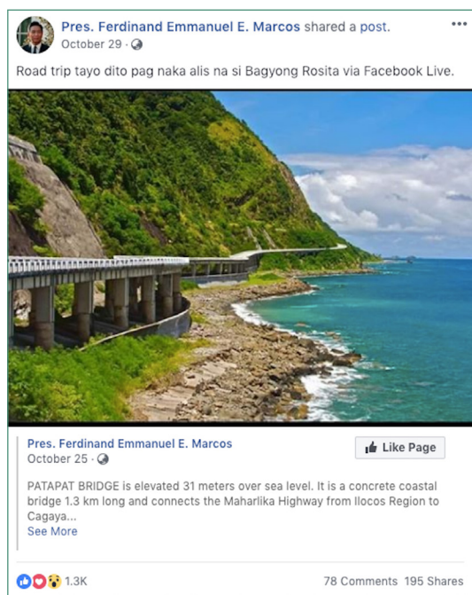
Figure 13 A post from the Pres. Ferdinand Emmanuel E. Marcos Facebook page featured Marcos Sr.'s Patapat bridge in Northern Luzon. The author took the screenshot in 2018.

that the absence of any form of control is detrimental to the reliability and rationality of amateurs' statements and arguments, consumers of amateurs' contents, on the contrary, perceive otherwise.