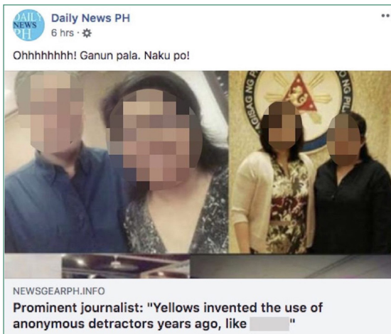
Figure 8 A post from a Facebook page that presents itself as a news outlet. The caption reads, “Oh! That’s how, Oh no!” The post claims that the yellows paid “anonymous detractors.” The author took the screenshot in 2019.