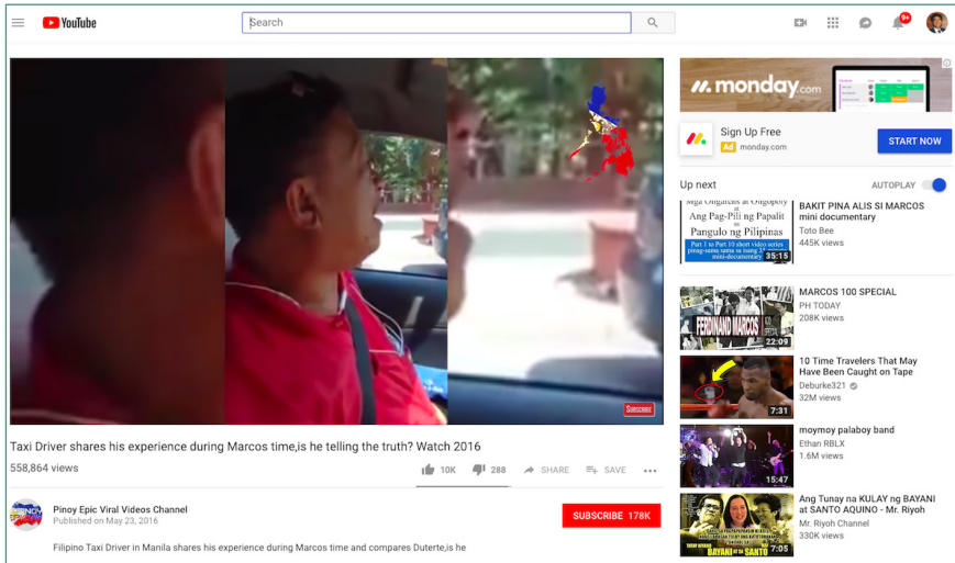
Figure 3 A YouTube video expressing nostalgia for the Marcos rule. The author took the screenshot in 2018. This video has been taken down in 2019.

others vented their rage toward Filipinos who contributed to the late strongman's ousting as they complained about rampant corruption and social deterioration.