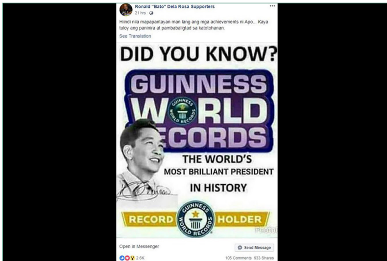
Figure 1 Posted on Ronald “Bato” Dela Rosa Supporters Facebook page. Before being elected as a senator, Dela Rosa was the police chief that headed Duterte’s drug war. The caption says that no other leaders can equal the achievements of Apo (Marcos). The late Marcos never received such recognition from the Guinness World Records. The only record he had with them is the “greatest robbery of a government,” which recorded an estimated 5-10 billion USD. The author took the screenshot in 2019.