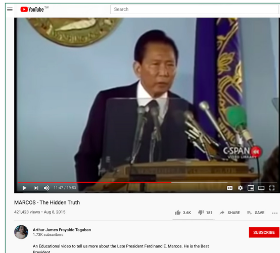
Figure 9 A YouTube video titled “Marcos—The Hidden Truth.” It presents itself as a primary source (archival video) that showcases Marcos Sr.’s “brilliance.” The author took the screenshot in 2018.