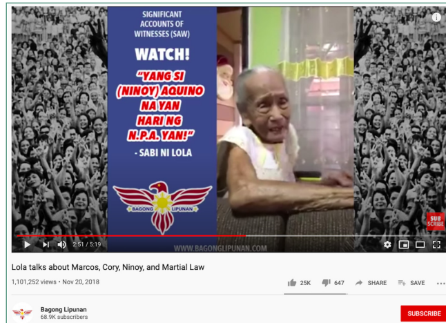
Figure 12 A YouTube video of an elderly sharing her good memories of Marcos' martial law. Her recollection was mixed with accusations that the murdered Senator Benigno "Ninoy" Aquino, Jr. of being the "king of N.P.A." (New People's Army, the armed wing of Communist Party of the Philippines). The author took the screenshot in 2018.

Ferdinand Emmanuel E. Marcos invited people on a road trip while showcasing a bridge constructed during the late dictator's time (Figure 13). The post subtly boasts that the Marcos-constructed bridge has withstood several typhoons. Like other posts about infrastructures built by Marcos Sr., the video commonly receives comments that touted Marcos Sr. projects as well-constructed (in contrast to the "inferior" infrastructure projects of the yellows) or claimed that only a Marcos could achieve such a feat.