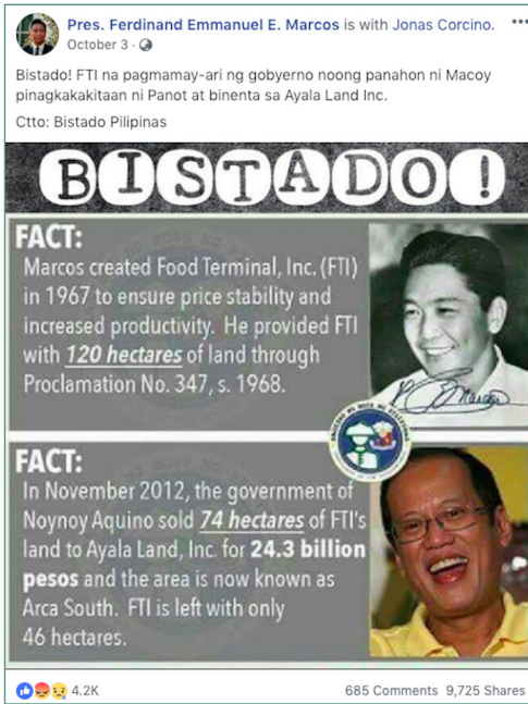
Figure 7 A post “revealing” how the late President Benigno Aquino III (son of the late Senator Ninoy Aquino and former President Corazon Aquino) profited from government property. The author took the screenshot in 2019.