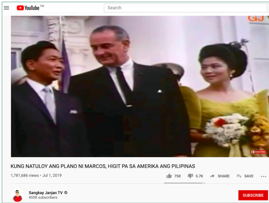
Figure 4 A YouTube video from Sangkay Janjan TV promoting the idea that the Philippines would have surpassed the United States' economy if only Marcos Sr.'s plans were continued. The author took the screenshot in 2020.

tripartite perspective allowed the propagandists to reverse what dark and light signified and add a third dimension that concerns the future. Similarly, narratives that manifest a nostalgia for a Marcos golden age employ a tripartite approach to transform the signification of the Marcos years ( dark to light ) and the revolution that ousted the dictator ( light to dark ). And since the nostalgia is shared within the Marcos propaganda network, these narratives mobilize the third dimension of light to make people wish to return to a glorious past—a dream that the Marcoses vow to achieve once they complete their return to power.