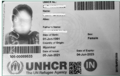
Figure 1 The front view of UNHCR refugee card for Rohingya in India.