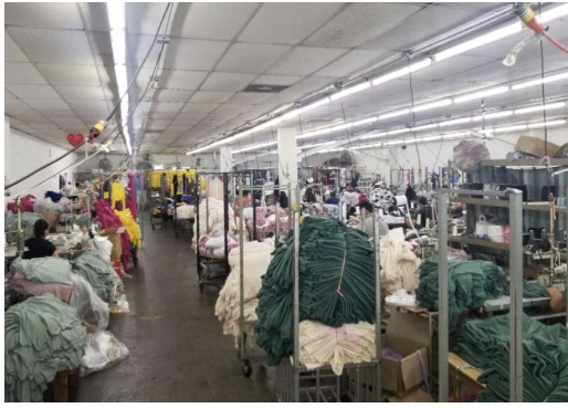
<Fig 4> Inside of a cutting/sewing factory

-Trimming: They supply subsidiary materials used in clothing such as patches, zippers, laces, and buttons.(KOTRA, 2015) 9)