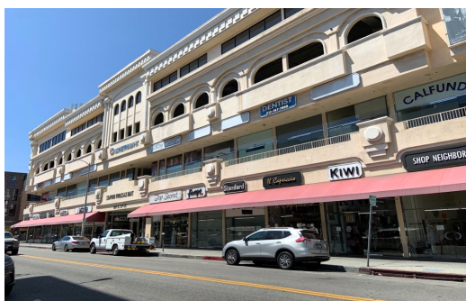
<Fig 1> LA Jobber market

as fabric, trimming, pattern-making, and quality control to Koreans in L.A., but also allowed business expansions with cooperating companies in Korea. Furthermore, this business relationship with Korea has continued into the present time as the initial L.A. immigrants' children naturally took over for their parents and continued to run the family business.(CH Moon, 2014a, pp.4-5) 8)