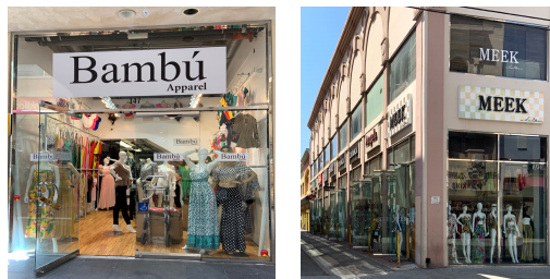
<Fig 2> Wholesaler(private brands) of the jobber market

-Wholesale : Can be linked to private brands as well. Some brands incorporate physical forms of space such as showrooms or stores, but others only exist as production factories to manufacture garments for other stores or to supply finished products for large-scale buyers. There are two ways of supply: 1. Delegate some portion of production work to subcontractors to complete the final phase of production at the factory; 2. Managing the entire production stage from buying fabric to completing garments.