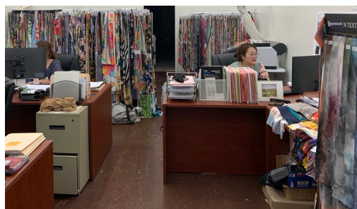
<Fig 3> Inside of a fabric company with design headers

-Fabric : They provide fabric for diverse garments. Korean companies occupy most of the market. However, they face competition from Jewish companies. Moreover, the number of Chinese companies have recently increased. There are two types of companies: ones that possess self-production systems for fabric and ones that import fabric to then sell the produced goods through a comprehensive production structure. The author's focus is on fabric import companies since they form the mainstream in fabric businesses of the jobber market.