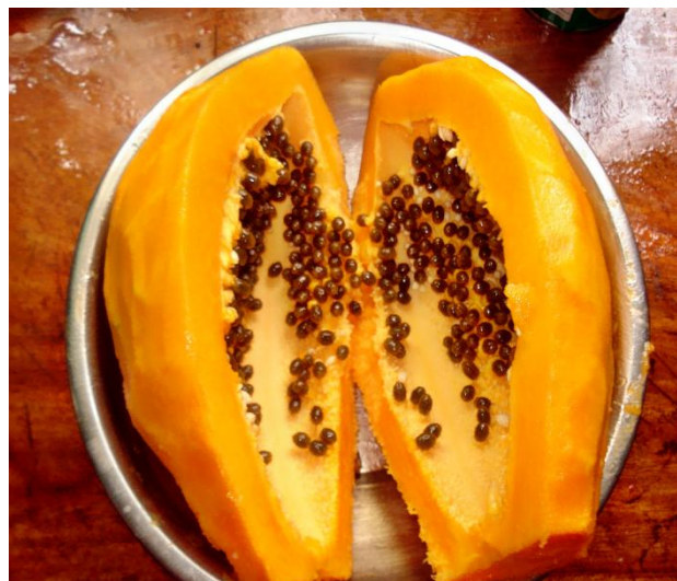
Fig. 7. Papaya fruit cavity containing black seeds

and are dispersed throughout most plant tissues. The papaya-latex is well known for being a rich source of the four cysteine endopeptidases namely papain, chymopapain, glycyI endopeptidase and caricain (Azarkan et al., 2003) and the content of latex may vary in fruit, leaves and roots. As the papaya fruit ripen, the amount of laticifers cells that produces latex decreases (OECD, 2005). Therefore, ripe papaya contains less latex and other constituents.