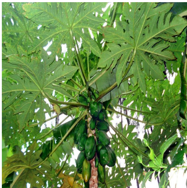
Fig. 2. Papaya leaves arrangement like an umbrella-like canopy and melon-like unripe fruits hang in clusters attached to the trunk top just under the leaf canopy.

Papaya is a small, frost-tender, succulent, broadleaved evergreen tree that bears papaya fruits throughout the year. Each tree typically has a single, unbranched, non-woody trunk bearing the scars of old leaf bases. The trunk is topped by an umbrella-like canopy of palmately lobed leaves. Large, fleshy, melon-like fruits (papayas) hang in clusters attached to the trunk top just under the leaf canopy (Fig. 2). Papaya typically grows to 6 - 20' tall (container plants to 10' tall) and is most