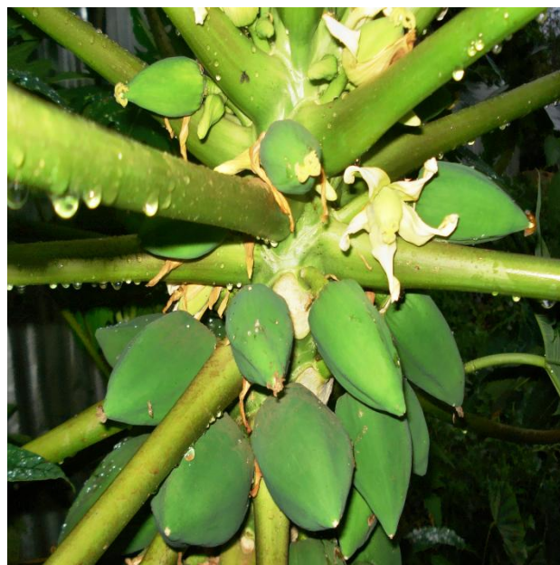
Fig. 5. Papaya tree with flower and unripe fruits

toothed (Orwa et al., 2009). The species plants are typically dioecious (hermaphroditic), and maple trees are uncommon. Hermaphrodite trees (flowers with male and female parts) are the commercial standard, producing a pear shaped fruit. These plants are self-pollinated (Jari, 2009).