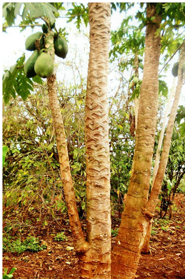
Fig. 3. Papaya tree with branches

Leaves spirally arranged, clustered near apex of the trunk; petiole up to 1 m long, hollow, greenish or purplish-green (Fig. 4); lamina orbicular, 25 - 75 cm in diameter, palmate, deeply 7-lobed, glabrous, prominently veined; lobes deeply and broadly