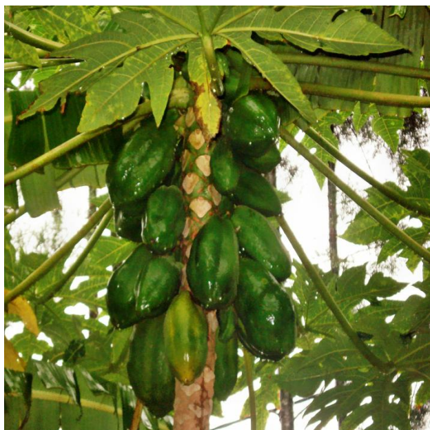
Fig. 4. Papaya unripe and semiripe fruits