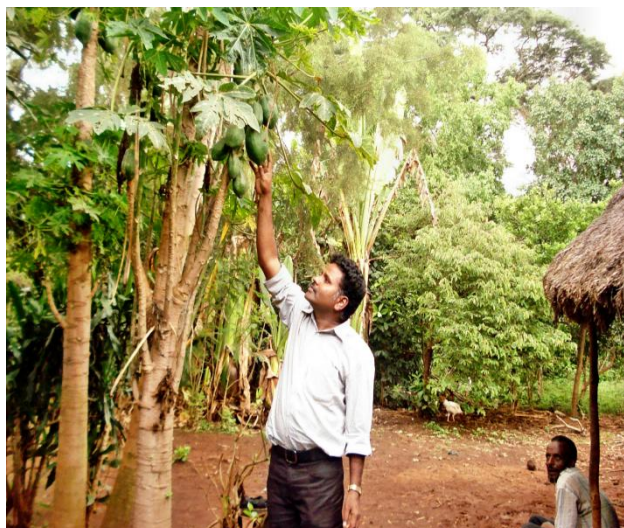
Fig. 6. The author with the unripen papaya fruit in Jimma zone, Eyihiopia