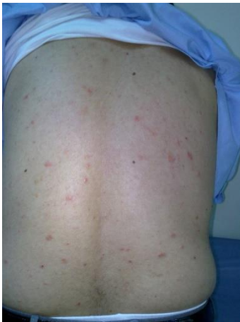
Fig. 1. Multiple yellowish papules on the back

A 38-year-old man attended with papular lesions on both forearms and back. The lesions began on extensor surfaces of forearms 10 days ago, subsequently spreading to his back. The patient described mild pruritus. There was hyperlipidemia in his and his family's (his mother and uncle) medical history. He denied a family history for similar lesions. His previous levels of cholesterol and triglyceride were about 400 and 800 mg/dL respectively. He did not have history of using any drug for hyperlipidemia or another health problem. He told that he had begun to drink hawthorn vinegar 50 mL/day for three weeks. Dermatological examination showed multiple pinkish-yellow papules over the extensor aspects of forearms and the back and some of them had lobulated appearance (Figs. 1-2).