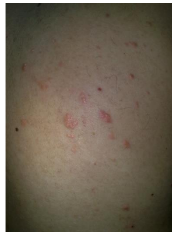
Fig. 2. Closer appearance of the papules

normal limits. The skin biopsy revealed foamy macrophages which have an eccentric nucleus and a large amount of cytoplasm infiltrating the dermis. They were stained with CD 68 (Figs. 3-4). Eruptive xanthoma was diagnosed with clinical, laboratory and pathological findings. He was consulted to endocrinology and hawthorn vinegar was stopped and diet for hyperlipidemia and hyperglycemia was suggested. Blood glucose level decreased to normal limit and lipid levels prominently diminished and the lesions improved in 1 week with only diet. It was thought that hawthorn vinegar might have triggered the increase of lipid and glucose levels on the base on familial hyperlipidemia in this patient.