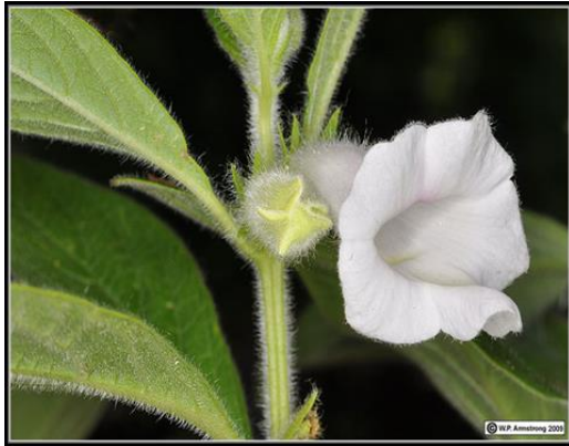
Fig. 2a. Plant of sesame with flower