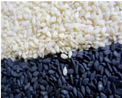
Fig. 2b. Morphology of the seed