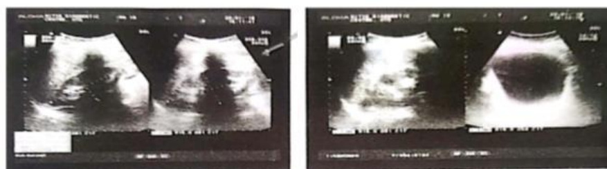
Fig. 3 & 4 USG (Kidneys) showing normal echo-texture of kidney at post treatment