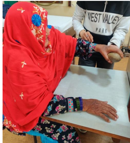
Figure 2. Performing task specific activity for grasp.

The occupational therapy intervention focused on increasing range of motion, strength, and function of the left wrist. The treatment consisted of therapeutic exercises, joint mobilization, and sensory re-education. The patient was also instructed in the use of adaptive equipment to assist with activities of daily living. 4,8 The intervention was provided for 8 weeks, thrice per week, with each session lasting 45 minutes (Figure 2).