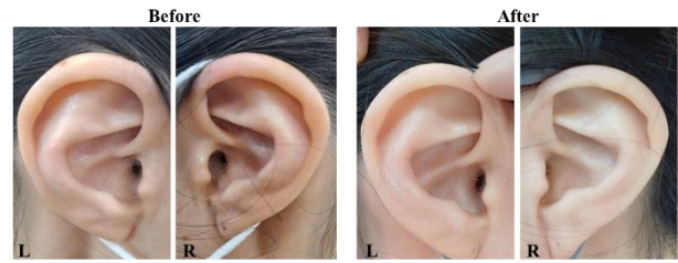
Fig. 2. Ear morphology changes in the patient after OCNT. The overall skin tone of the patient's ear dermatome corresponding to the uterus and stomach was brightened after OCNT. Whereas there was indentation of the lower portion of the ear which represents the inner ear prior to OCNT, this area became relatively flat post-OCNT.

In some respects, this method of diagnosis may seem rather odd. It appears ironic that the ears, which are part of the body and have a relatively small surface area, represent various body parts. First of all, the concept of dermatomes must be understood. Dermatomes are areas of skin on the body that rely on specific nerve connections to the spine. All skin sensations are transmitted by peripheral nerves that are spread over the extremities. The peripheral nerve root extends from the dorsal horn of the spinal cord, and in cases where the site of paresthesia coincides with a given dermatome, the problem experienced by the patient is likely to be associated with the peripheral nerves serving the dermatome. 31,32 From this perspective, the deep indentation in the ear dermatome of the patient, which includes the inner ear, suggest that the patient is suffering from problems with the corresponding organ. Also, the clear difference observed pre- and post-OCNT in the ear dermatome which represents the uterus and stomach indicates that the reflex points and auxiliary blood vessels of the organs are closely associated (Fig. 2). As the VAS (Visual Analog Scale) Score, which represents only the subjective opinion of the patient, was improved to 1 or 0, this relationship cannot be precluded.