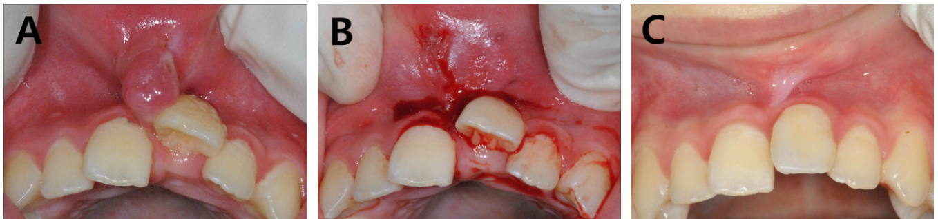
Fig. 2. Intraoral photographs of the patient. (A) Intraoral photograph showing a pedunculated mass on the labial mucosa. (B) Intraoral photograph taken immediately after the excisional biopsy. (C) Intraoral photo taken at the 8-month check-up visit, showing improved oral hygiene status and spontaneous reduction of labial inclination of the maxillary left central incisor by the force of the upper lip and perioral muscles without recurrence of the lesion.