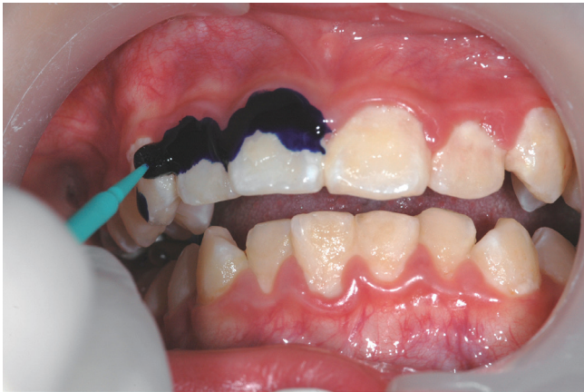
Fig. 1. The 3 tone plaque disclosing gel was applied on tooth surfaces with a microbrush.