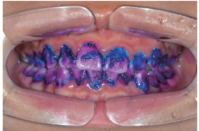
Fig. 2. The tooth-surfaces were changed to pink or red, blue or purple, and light blue.