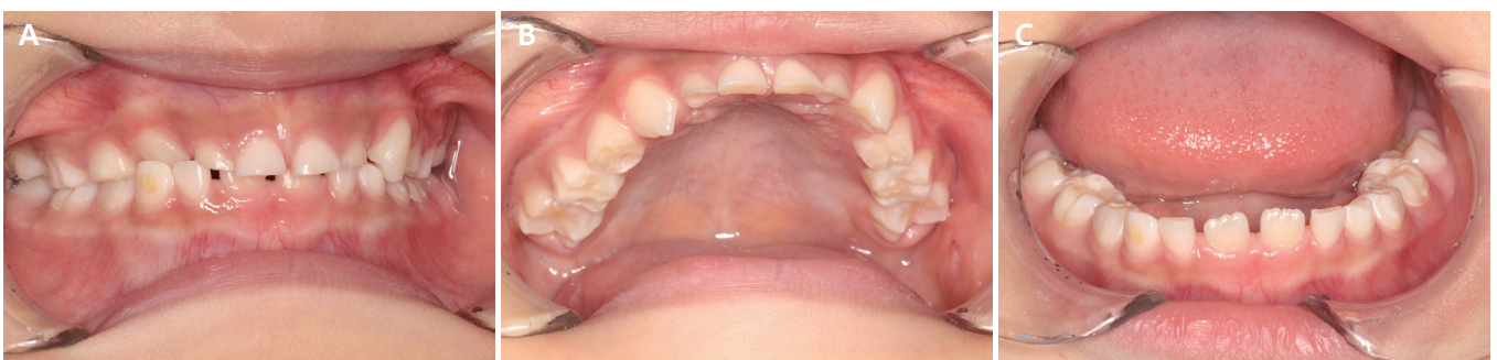
Fig. 2. Intraoral view of the 1st case. At the age of 6 years, both maxillary permanent canines are fully erupted and the right permanent canine formed a crossbite with the mandibular primary canine (A-C).