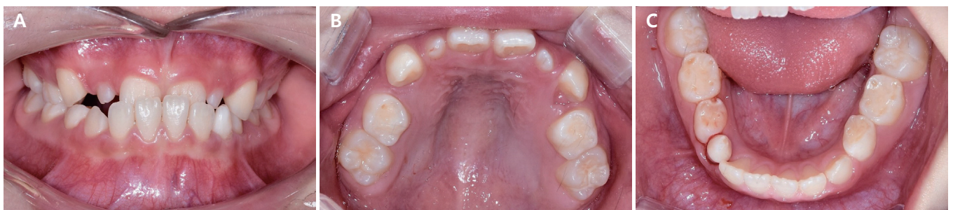
Fig. 4. Intraoral view of the 2nd case. At her 1-year follow-up check, at the age of 7 years, both maxillary permanent canines are fully erupted (A-C).