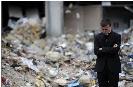
그림 2. 원래의 이미지 Fig. 2. The Original Image

Take experiment to compare the original Canny edge detector with the improved Canny which has Mean Shift procedure in advance, the different is obvious: