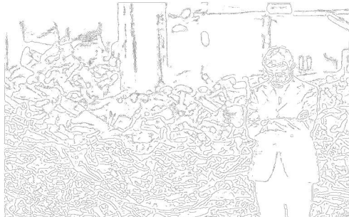
그림 3. \sigma=0.4 , Lratio=0.4, Hratio=0.8일때의 Canny 알고리즘의 결과 Fig. 3. The Result Just use Canny Algorithm, where \sigma=0.4 , Lratio=0.4, Hratio=0.8.