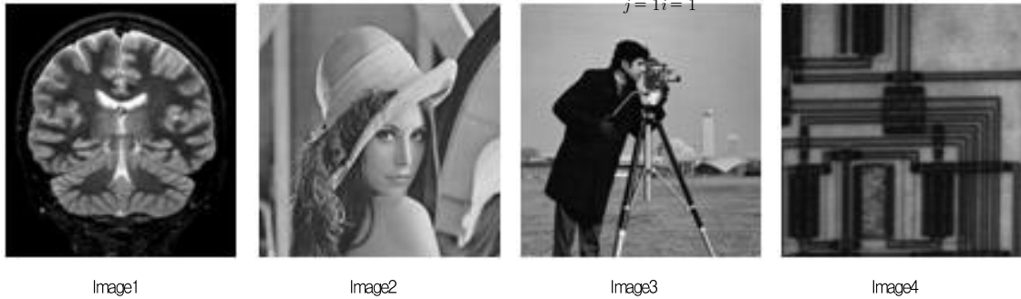
그림 1. 제안한 알고리즘과 다른 FCM 기반 알고리즘의 성능평가를 위해 선택된 타겟 이미지 Fig. 1. Selected target images for evaluating the performance of the proposed and other FCM based algorithms

Step 5: Identify whether the terminal condition