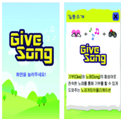
Figure 3 The First Page of the Application

The general structure is like a karaoke system with many donation features added in order to promote some easy donations. The first page of the application is as follows.