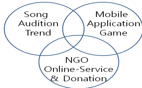
Figure 1 Concepts

This study suggests a mobile singing game which utilizes the popularity of audition programs in Korea. The aim is to disseminate the giving culture in Korea. The game will take an important part in the online activities of NGOs.