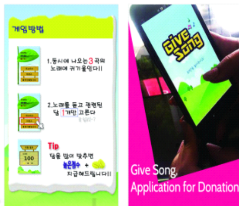
Figure 4 Games