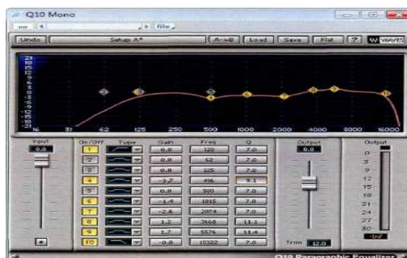
Fig. 4. An example of vocal equilibrium - Q10 software equilibrium of waves

The 500Hz-5kHz part of human voice is the overtone part which will affect the feeling and the sense of immediacy of human voice. It will be slightly attenuated by 500Hz-3kHz or so to highlight the high frequency (above 4kHz) overtone, making human voice more powerful. The voice then will have a certain sense of thinness. This way is quite common for sound with multiple instruments. It may seem a bit acute to hear the sound alone, but when all the instruments are filled in, the overall band of the mix will be balanced, rather than a full band of human voice over the whole band. The overall feeling of the audio mix is the most important part. It is the balance and smoothness of the whole sound field rather than the detailed performance of a musical instrument that really matters.