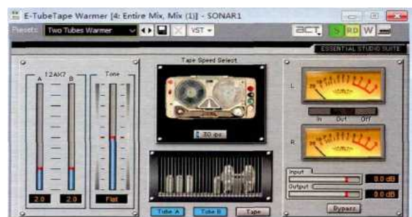
Fig. 1. US E-TUBE tape warmer simulation effector

Of course, except for these effectors, we can use pressure limiter, equalizer, tape style simulator and tube saturation simulator of all styles which can be connected in the channel and speed up our adjustment process, greatly improving work efficiency. Sometimes, we can also add channel strip with the commonly used effectors like pressure limiters, equalizers, noise gates and expanders on it to the channel.