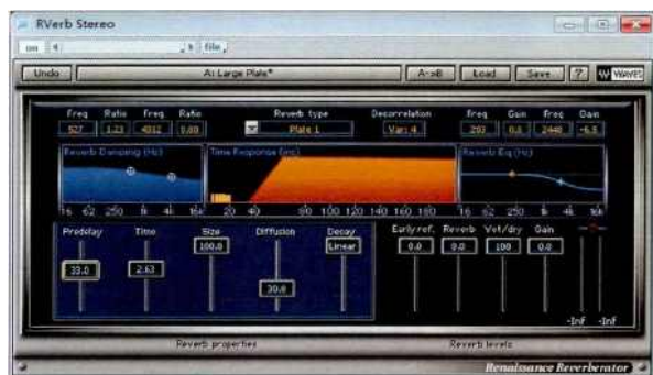
Fig. 6. Increase sense of depth with long reverberation using RVerb reverberator of waves

Reverberation and delay may be added to solo guitar performance to make the sound more exciting. Short plate reverberation can improve the characteristics and thickness of the medium frequency and a small amount of long reverberation will strengthen the sense of depth. Octave notes or quarter notes can be used for delay and sometimes half note is also used. The feedback can be set to zero or be increased. Reverberation makes the solo electric guitar performance highlighted even without too much volume and betters the atmosphere.