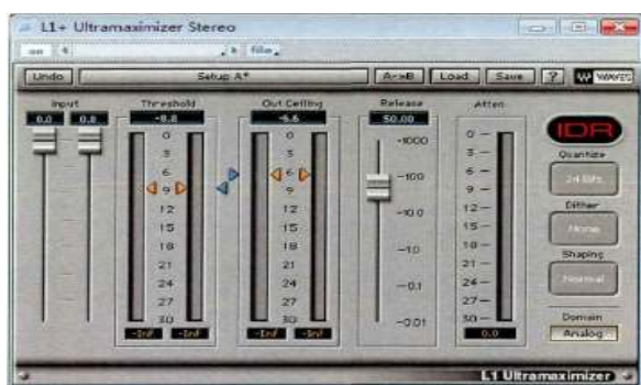
Fig. 3. Limit the bottom drum and Bass by binding them together, using waves L1 limiter

make the overall bass unstably strong and weak: when the drum and Bass are played at the same time, the bass becomes louder; but when they are palyed independently, the bass reduces. So the bottom drum and Bass should be on the same line and they are to be compressed or limited with the compression amount of about 6dB, then the overall volume of the bottom drum and Bass is controlled to a stable value. It should be noted that the value of the compressor should be set to the largest when exiting (about 50ms) to prevent harmonic distortion.