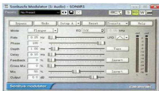
Fig. 4. Modulation software of Sonitus [FI] using Flanger preset