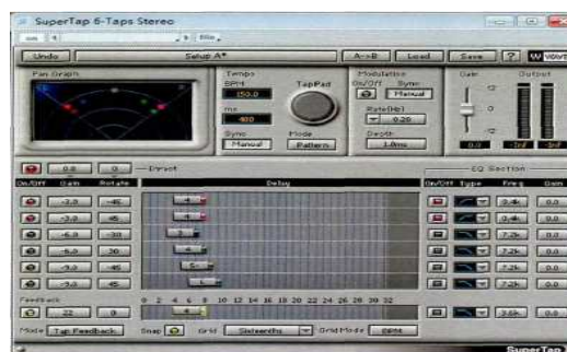
Fig. 3. Low cut on delay signal below 400Hz using the SuperTaps delayer of waves

If the delay signal and the original signal are exactly the same, it will make people feel untrustworthy and boring. And if the returned delay signal is relatively large, it will interfere with the original signal. Then it will be considered an error rather than a means of treatment. Thus, we often conduct high-cut and low-cut processing on returned delay signal so that the delay signal can be distinguished from the original signal.[7] For instance, high cut on the delay signal can make the signal darker, and because the returned delay signal is getting weaker and weaker, it will create a profound feeling in the sound field. Of course, low cut on the returned signal can also help distinguish the delay signal from the original signal and keep the warmth of the original signal undisturbed. The warmth sense of the original signal is generally around 300HZ-500HZ, therefore, low-cut frequency will be set to 400Hz. Meanwhile, the sound field is usually filled with the fundamental frequency (usually between 200HZ and 800HZ) of many instruments, so low cut on the delay signal will release the limited space in the sound field, making the sound field more broad and relaxed without too much medium frequency.[8]