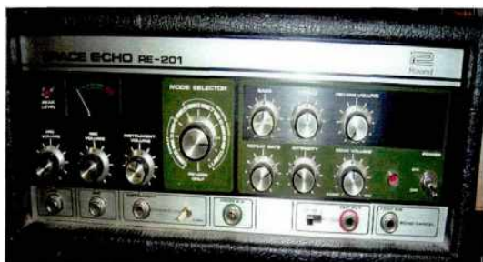
Fig. 2. Roland RE201 Space Echo hardware

The delayer usually includes the following modules: input / output level adjustment module, delayed time module and feedback suppression module. The only thing to be noted in the input / output level adjustment module is that it shouldn't be overloaded. If the signal of one track enters into the delayer and the track itself is not overloaded, the delayer input level is zero, that is, no increase nor attenuation. Then the delayer input is not overloaded. But if the signal of several tracks enters into the delayer at the same time, then the level of the superposed signal may lead to overload in the delayer input. If overload is generated, the solution is to attenuate the input. Output is of the same principle. A track signal will not cause output overload but if the signal of several tracks shares one delayer, we should be careful then. Especially when the delayer is used as chorus, flanger or double effector, the delay signal has to be set as large as the original signal or a little bit larger. At the moment, overload will easily be caused.[3]