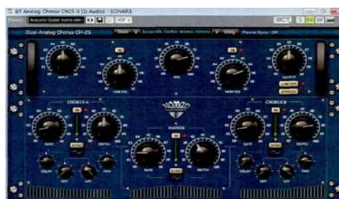
Fig. 5. BT Analog Chorus chs-3 chorus effector produced by Bluetube Company