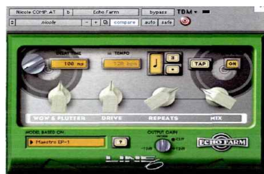
Fig. 1. Line6 Echo Farm software imitate Line6 ECHO hardware

Earlier, audio engineers used analog tapes to produce delayed echoes, called Tape-Echo. But now most people will make delayed sound using digital delayer. Some famous delayers include Line6 Echo and Roland RE201 Space Echo whose sounds are quite unique.[2] Combined with other effectors (such as Modulation), delayer can produce effects like chorus, flanger and double.