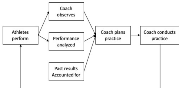
Fig. 1. A simple schematic diagram representing the coaching process (Hughes& Franks, 1997, p. 7).

the routine of coaching process that continuous research on the evidence of the needs of performance analysis of sport. Fig 1 is shown the needs of objective observation in the routine of coaching process.