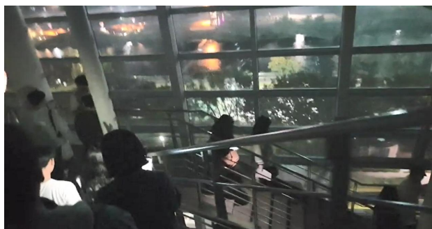
Fig. 3. Evacuation using a smartphone navigation application