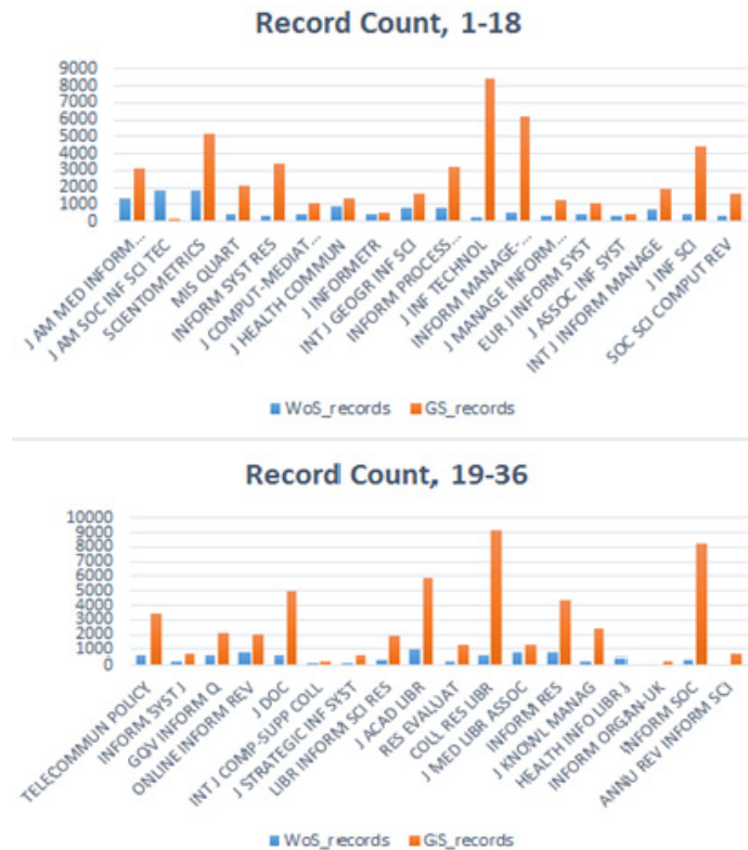
<Figure 1> Record Count for Journals in WoS and GS

The differences of these quantitative measures between the two databases were verified with t-Test. The results of the t-Test shows the differences of the number of records and citations between WoS and GS are both statistically significant with 99% confidence interval. The t-Test results from SPSS 21 are shown in <Table 4>.