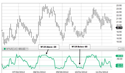
[Fig. 1] Williams %R Chart in Green

Usage: The Williams %R can be used in various trading strategies, including trend-following and range-bound strategies. Like all technical indicators, it's most effective when used in conjunction with other tools and analysis techniques.