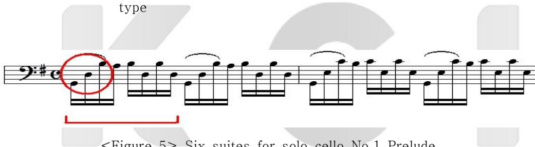
<Figure 5> Six suites for solo cello No.1 Prelude

Also, some participants commented that it was difficult to use the keyboard input mode because the interval of the first three notes is rather large. Through this response, it was found that the interval degree of notes sequences might affect the level of difficulty of input. Although monophony music is usually expected to have a better rate than homophony or polyphony, the accuracy rate of input was not affected only by complexity of harmony.