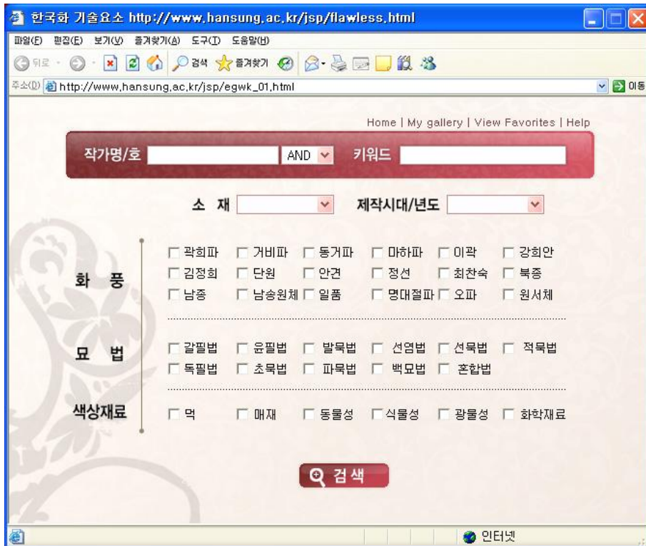
<Figure 2> Simple Search Screen

<Figure 3> is an example of the simple search showing how retrieval is done when a user input the creator, 'Hur Baekryun' and the subject keyword,