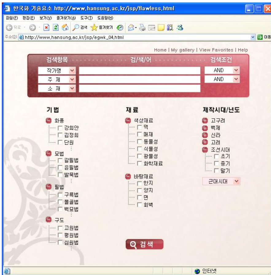
<Figure 5> Advanced Search Screen

Underneath that retrieval formula box, a trio-structured menu is built such as menus of techniques, materials, and production period/year. For selecting techniques, there are 4 pull-down menus for such like: ① styles of painting with 20 attributes, ② styles of line drawing with 11 attributes, ③ styles of brush stroke with 19 attributes, and ④ styles of composition with 13 attributes. Also, for selecting materials, there are 2 pull-down menus such like: ① color materials with 6 attributes, ②