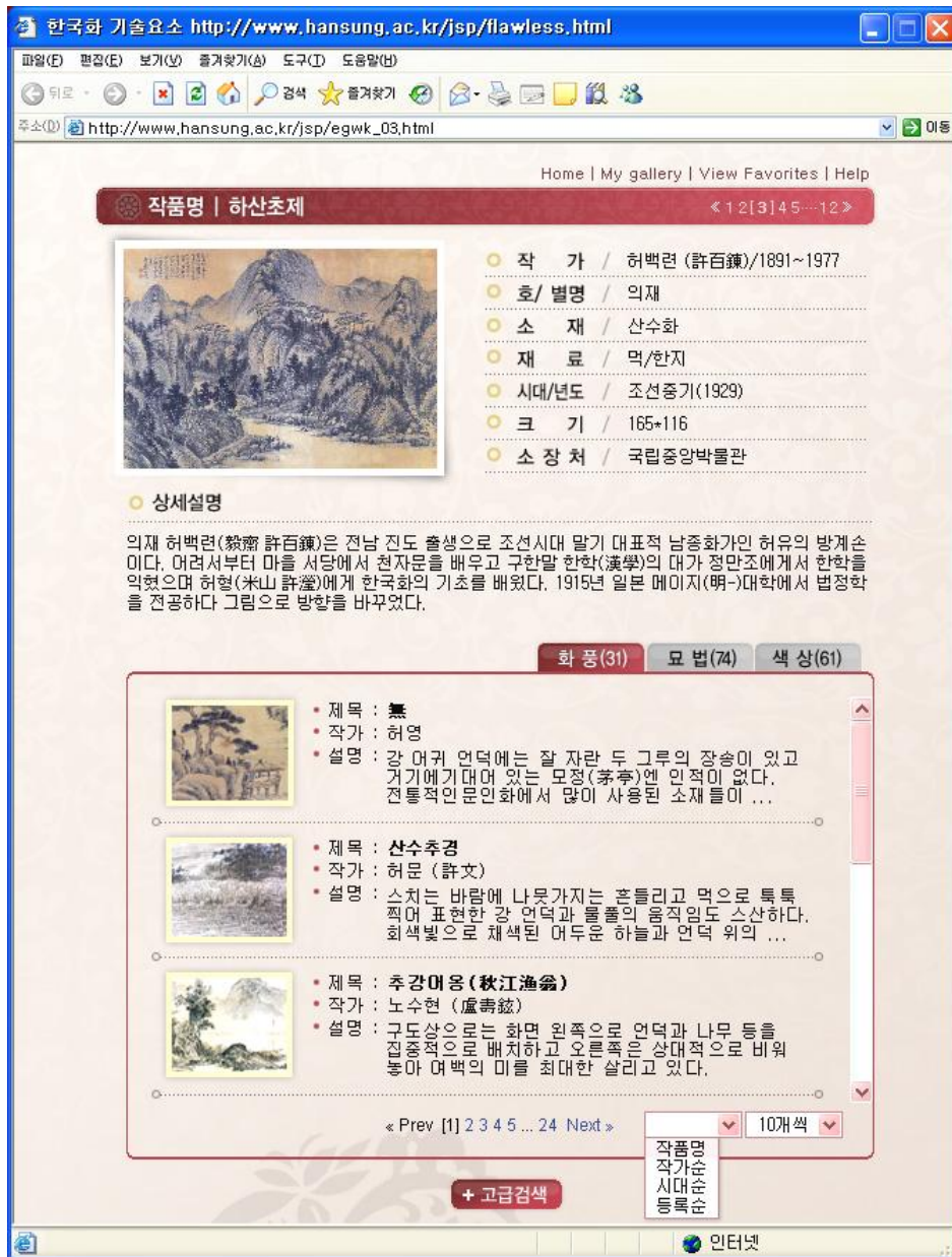
<Figure 4> Display Screen of Simple Search Results

also choose the advanced search option(See <Figure 4>).