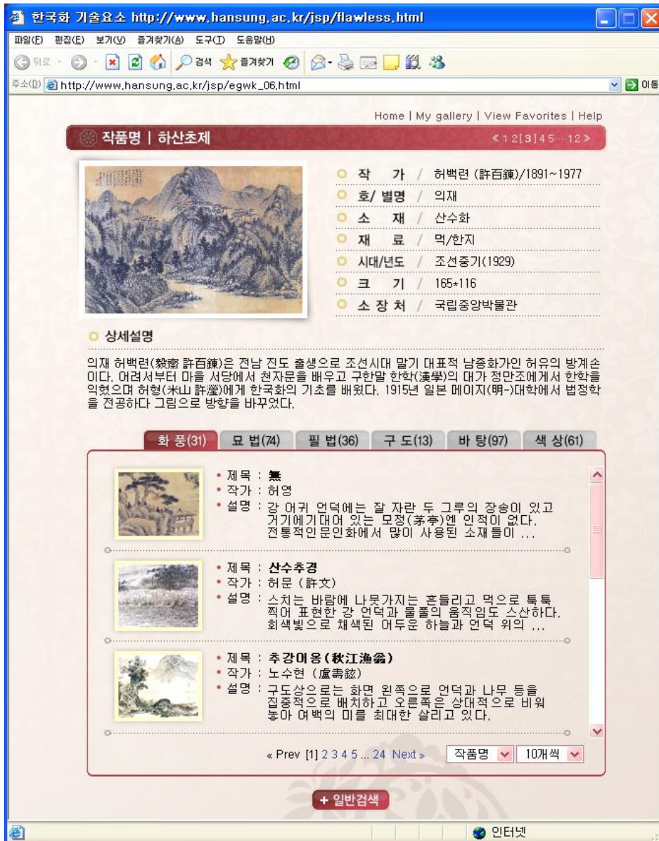
<Figure 7> Display Screen of Advanced Search Results

the Mid-Lee’s dynasty, that it was painted on Korean paper with Chinese ink and that it is held in the National Museum of Korea. Moreover, the user is also able to find out that there are 31 paintings