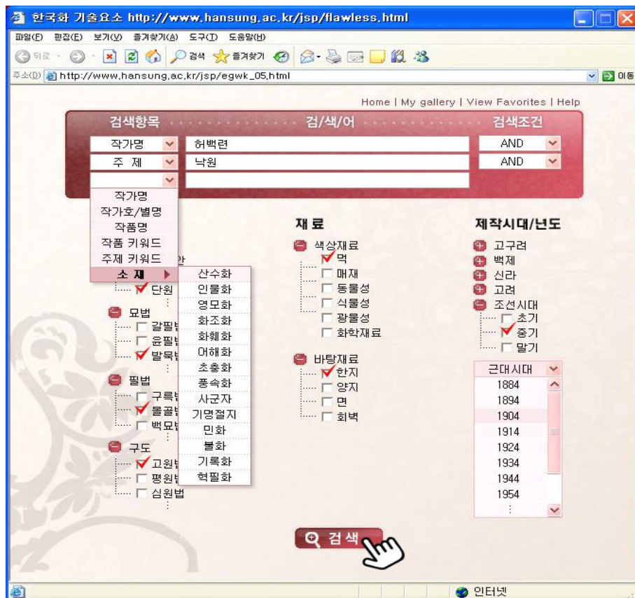
<Figure 6> The Example of Advanced Search

The overall structure of the result display for advanced search is same as that of simple search. But, advanced search allows users to browsing Korean paintings by style of paints, style of line drawing, style of brush stroke, style of composition, ground materials and color materials. Therefore, as can be seen in <Figure 7>, "Hasanchoje" was