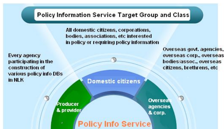
<Fig. 2> Policy Information Service Target Group and Class

In the questionnaire survey hereof, this study sought to conduct policy information profile survey and demand analysis on governmental agencies publishing policy information, so that it could propose a model for PIS based on said survey and analysis. There were total 298 agency libraries that participated in this survey, including libraries installed in central administrative agencies, incidental agencies, state-affiliated institutions, government-funded institutions, government-invested institutions and local governments. Here, questionnaire sheets were distributed on Oct. 31, 2007 and collected on