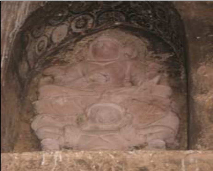
Figure 5. Vishnu at Nathlaung Kyaung