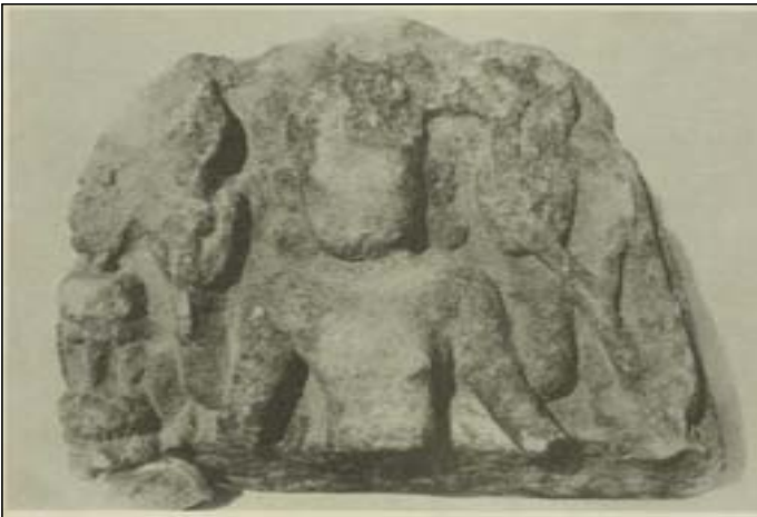
Figure 3. Vishnu at Shwegugyi Temple