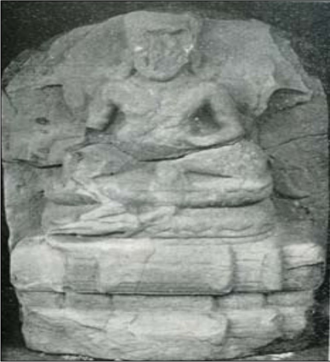
Figure 16. Shiva at Shweonhmin monastery at Myinpagan

prostrate under his right foot is the apasmārapurusha known only in South India as associated with Shiva. The apasmārapurusha was the symbol of Dirt (mala) (Ray 1932: 60-61). Coomaraswamy says that the scene has been depicted as early as the pre- Kushāna times, 1 century B.C., on the GudhimallamS'ivalirigam at North Arcot. In later times Shiva Natharāja is commonly shown dancing on it (Coomaraswamy 1927: 39).