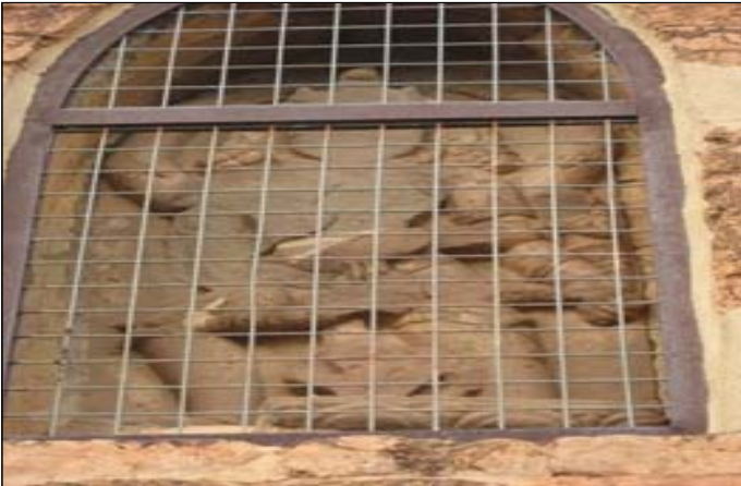
Figure 9. The Man-Lion, avatar of Vishnu at Nathlaung Kyaung