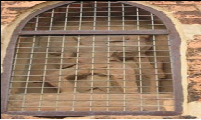
Figure 8. The Boar, avatar of Vishnu at Nathlaung Kyaung

The atheist demon Hiranyakas'ipu (Gold Cushion) ill-treats his son Prahtāda for praising Vishnu. Hiranyakas'ipu asks where Vishnu is. His son replies that the god is everywhere, even in the palace-pillar. Furious, the demon kicks the pillar. The Man-Lion emerges and tears him to pieces. Brahmā had not granted the demon to slain by man nor animal. The sculpture is on the south face near the southwest corner (Luce 1970: 221) <Figure 9>.