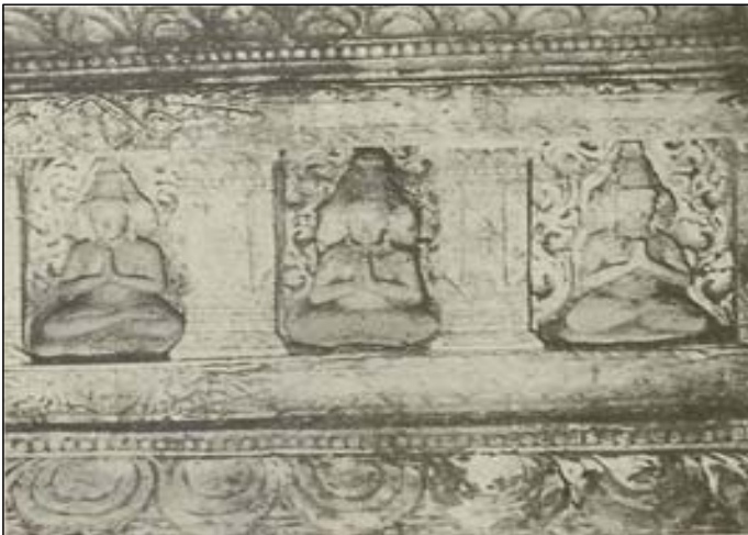
Figure 20. Brahmā at Myebontha Payahla Temple