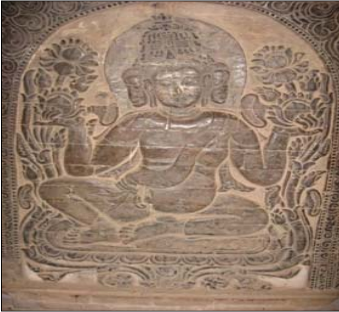
Figure 19 b. Brahmā at Nanpaya