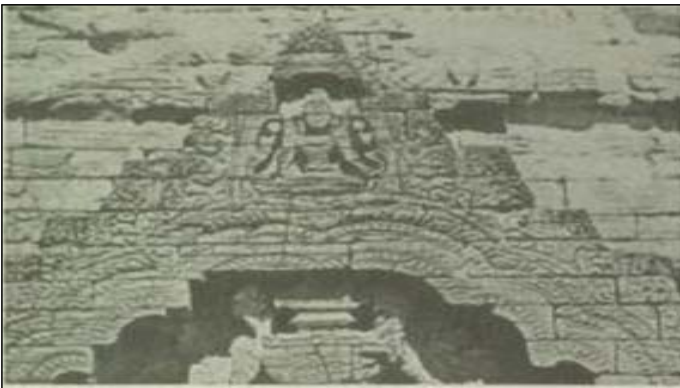
Fig. 26. Srī at Nanpaya