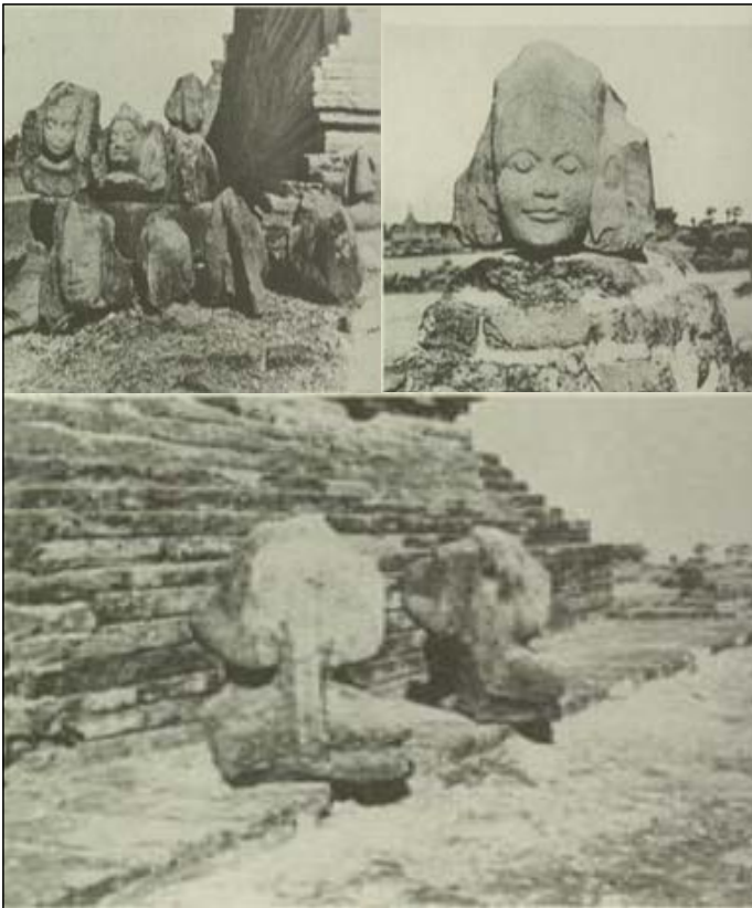
Figure 21. Ganes'a and other divinities at Shwesandaw (Mahapeinnè)

Vināyaka, from which his Old Myanmar name, Mahāpinaypurhā is derived (Luce 1970: 205). According to tradition, the original name of Anawrahta's Shwesandaw is Mahapeinnè , and it is sometimes called the Ganesh temple after the elephant headed Hindu god (Aung Thaw 1978: 75) Ganes'a and other Hindu divinities were placed at the corners of the different pyramidal stages as guardian deities of the Buddhist shrine. The stone figures of Hindu deities were placed originally at the corners of the five terraces of the Shwesandaw <Figure 21>. They symbolically guard, the ascent of Mt. Meru with the Cūlāmanicetiya of TāvatiÑsa at the summit (Luce 1970: 205).