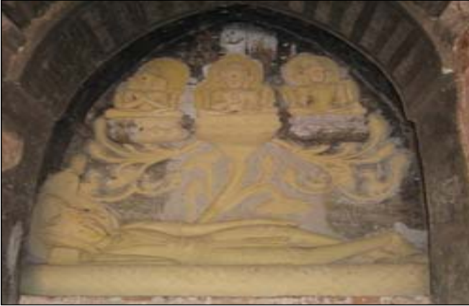
Figure. 4. Vishnu reclining on Serpent Ananda at Nathlaung Kyaung

Garuda has more similarities with Khmar rather than the Indian models, and is closest to those found on the lintels from the 10th and 11th century Khmar sites, sharing their power and strength (Gutman et al. 2012: 8) <Figure 5, 6>.