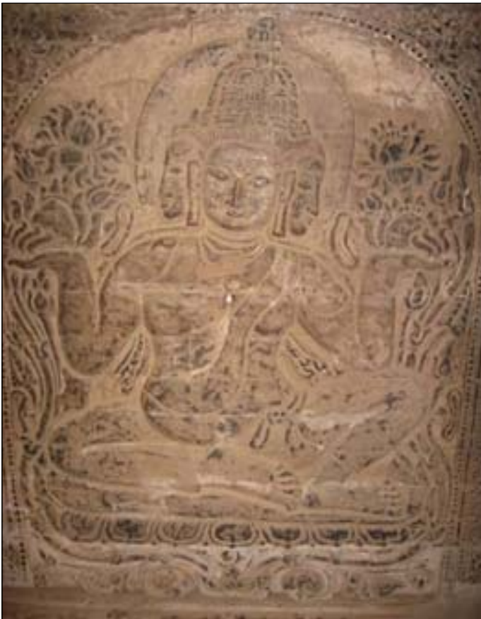
Figure 19 a. Brahmā at Nanpaya

the flowers. The pose of hands and the lotus forest are strikingly like those of the Brahmā pair in the porch paintings of Myinkaba Kubyaukkyi. The gods in the paintings however sit in padmāsana with their head erect and their arms symmetrical. In the Nanpaya, one knee is raised on which the elbow rests. The head with its gorgeous tower of braided hair and double-lotus finial gently leans that way. The flattened knee is always toward the centre, the outer knee raised, the supported elbow slightly higher than the other. The faces are more flexible in their eternal calm and posture <Figure 19 a, b>.