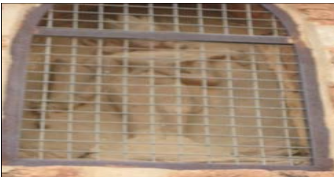
Figure 11. Vāmana, avatar of Vishnu at Nathlaung Kyaung