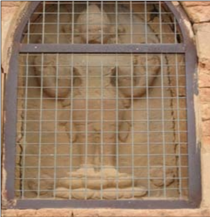
Figure 14. Sūrya, avatar of Vishnu at Nathlaung Kyaung