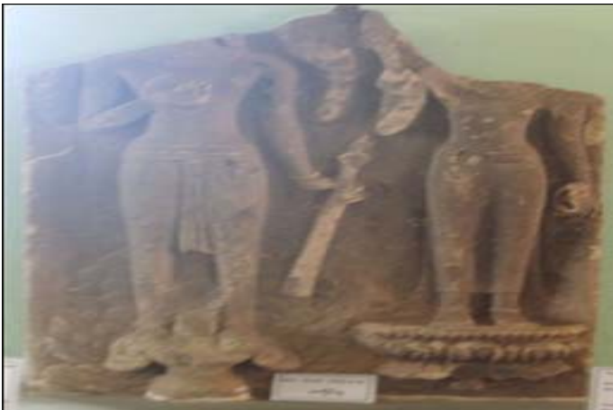
Figure 27. Srī (or) Lakshmī at Pyay Museum

A remarkable figure of Vishnu and his consort Lakshmī standing side by side was found by General de Beylie in the garden of Pyay Deputy Commissioner. It is a thin rectangular slab of soft sandstones, carved in bold relief, bearing the standing figures of Vishnu with his consort Lakshmī by his right side (Luce 1970: 216). The stone is broken from top and bottom with both heads are missing. But what remains of the slim, soft and supple figures of Vishnu standing on a Garuda and with Srī on a double lotus, is wonderfully clean and distinct. Vishnu on the left wears a short natural loincloth and twisted waistband. He has anklets and many bracelets. Srī has two hands only, holding a bunch of lotus flowers in her raised right hand. Hanging on her left side is her long, straining, sinuous hands. A defaced garuda is embellished with scales below the waist and tail feathers and wings outspread (Aung Thaw 1978: 28). It is quite unorthodox to find a stone sculpture where Vishnu and Lakshmī stand side by side. Also remarkable is the fact that this Vishnu standing on a Garuda is found in Myanmar alone. The image is dated to about 8th century A.D. (Ray 1932: 24-27) <Figure 27>. No separate image of Srī or Lakshmī image is to be found in Myanmar as an object of worship, but only as an architectural decoration which we can find everywhere on temples.