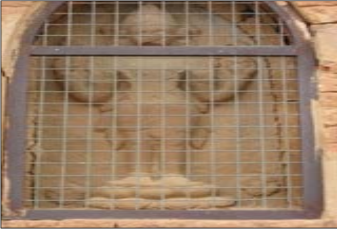
Figure 25. Sūrya at Nathlaung Kyaung

Dr. Ray remarked precisely for this reason that it is not one of the avatars of Vishnu, but seems to be an image of Sūrya of the South Indian type. The position of the two hands as well as the lotus buds held in one line with the shoulders is a significant indicator. No less significant is the number of the hands, which is a distinctive feature of South Indian Sūrya images, as well as the strictly erect standing posture. Sūrya in South India does not generally wear boots nor ride a horse-drawn chariot. Dr. Ray stresses the very intimate relation of Vishnu with the Vedic Sūrya . In the Vedas, Sūrya is never a supreme god, but is always identified with the sun. The idea that Vishnu is the sun appears to be still maintained in the worship of the Sun as Sūrya Nārāyana (Ray 1932: 42-43).