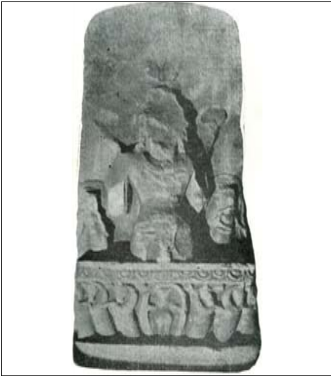
Figure 24. Sūrya at Rakhine