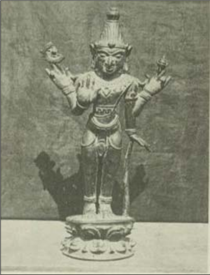
Figure 1. Vishnu at Bagan Museum