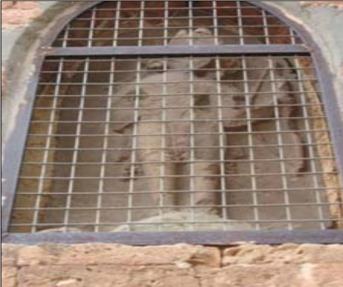
Figure 12. Rāmacandra, avatar of Vishnu at Nathlaung Kyaung