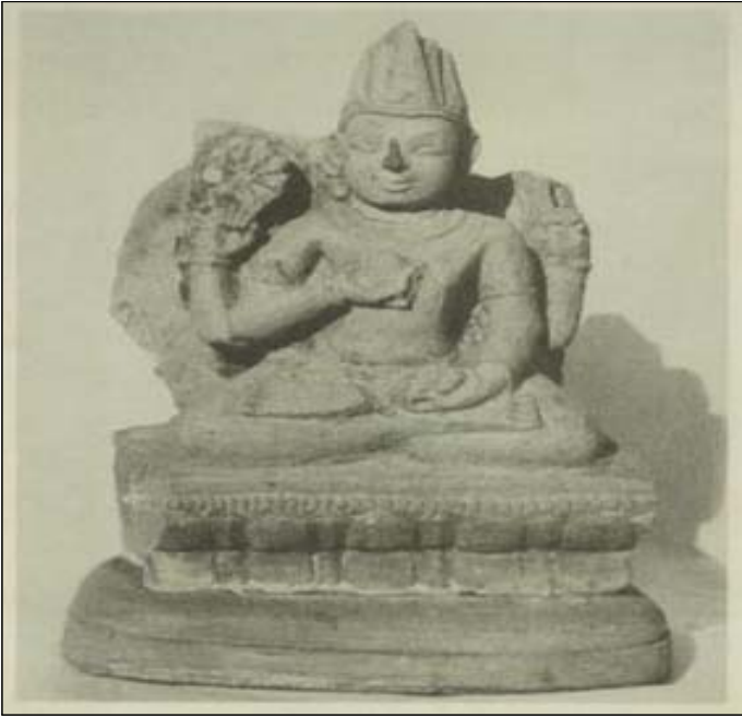
Figure 2. Vishnu at Bagan Museum