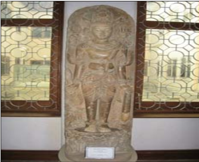
Figure 17. Shiva at Bagan Museum

mace in the lower ones. It is crowned of braided hair, jathāmukutha . The image is much disfigured, but its Indian anklets are visible, and beneath the feet is an animal broken, probably representing a bull. The image is that of Shiva (Luce 1970: 215). Dr. Ray comments that it is carved out of grey soft sandstone in bold and round relief. Its form and execution is distinctly South Indian, and may on stylistic grounds be dated not earlier than 12 century A.D. The presence of elaborate ornamental details is a characteristic feature of late mediaeval sculptures, and the static heaviness invariably remains one that is South Indian, especially Cola (Ray 1932: 59-60, 82) <Figure 17>.