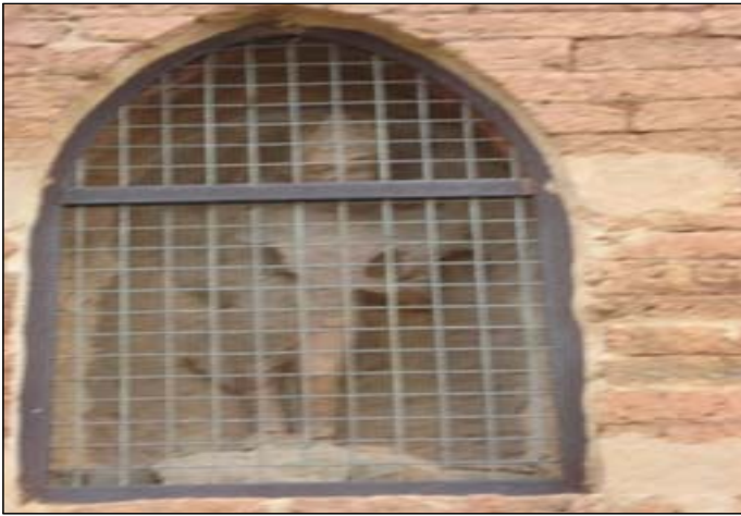
Figure 13. Parasurāma, avatar of Vishnu at Nathlaung Kyaung

crowned by a usual headdress and it is adorned with usual ornamental decorations. The body stands erect but the head is slightly slanted towards the right. Each of the two hands, hold respectively a staff-like object, perhaps a khadhga or sword raised upwards, and an axe, resting on the left shoulder (Ray 1932: 41). The sculpture is found in the north sector near the northeast corner <Figure 13>.