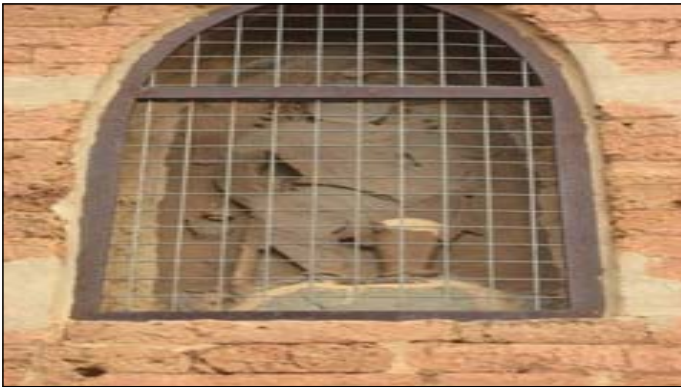
Figure 10. Vāmana, avatar of Vishnu at Nathlaung Kyaung