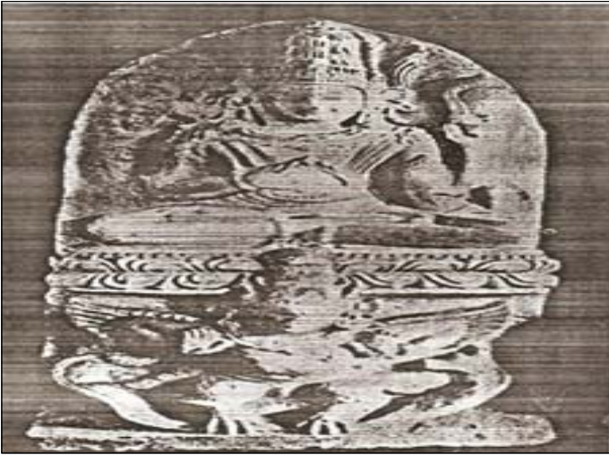
Figure 6. Vishnu at Nathlaung Kyaung

On the three other sides of the inner corridor, set in shallow niches, are three brick images of the standing four-armed god. The image on the southern section seems to embody at least three of the usual attributes: cakra , s'aṅkha and gadā . All these walls were once covered up to the roof with paintings, now difficult to read from below the whitewash. U Mya said that all the paintings represent seated figures of Vishnu with his devotees. Some attributes may be distinguished from the images such as the presence of, the cakra , conch, lotus, club, or sword. Some of the Vishnu images have four hands, while the other two are distinguished by marks discernible only with the presence of four hands. The devotees are ascetics wearing beards and moustaches, with hair tied up into two knots, one on each side above the ear. Each ascetic is seated with the legs folded on one side, and a hand raised in the namaskāramudrā facing the fire in a salver before him (Duroiselle 1930-34: 193) <Figure 7>. So the few depictions of Vishnu from Bagan, Srikshetra, and the Kawgoon caves near the Mon capital of Thaton show Vishnu with a mitred headdress in the Pala style of the 11th century, and in the fashion of the Vishnu avatars at the Nathlaung Kyaung.