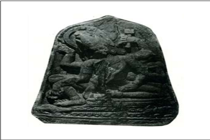
Figure 15. Stone Slab of Shiva, in bold relief from Thaton

the mallet, the upper right, probably the trident; the lower right holds the rosary, while the lower left, the citrus fruit. The snake garland falls his left shoulder. Against his left thigh sits Pārvatī , holding a yaktail flywhisk, her chin pressed between his two arms. The whole design of the weighting of the left bottom corner, the tense diagonal of the head, the zigzag energy of upper arms and knee, the fluid fall of snake-thread, lower arms and thighs is masterly (Luce 1970: 214-215). It dates 9-10 century A.D, and is in Orissan Style (Ray 1932: 79) <Figure 15>.