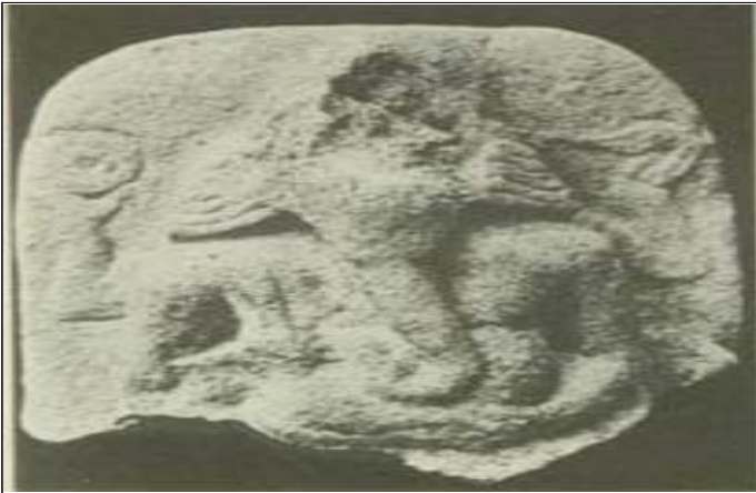
Figure 23. Ganes'a at Somingyi Pagoda