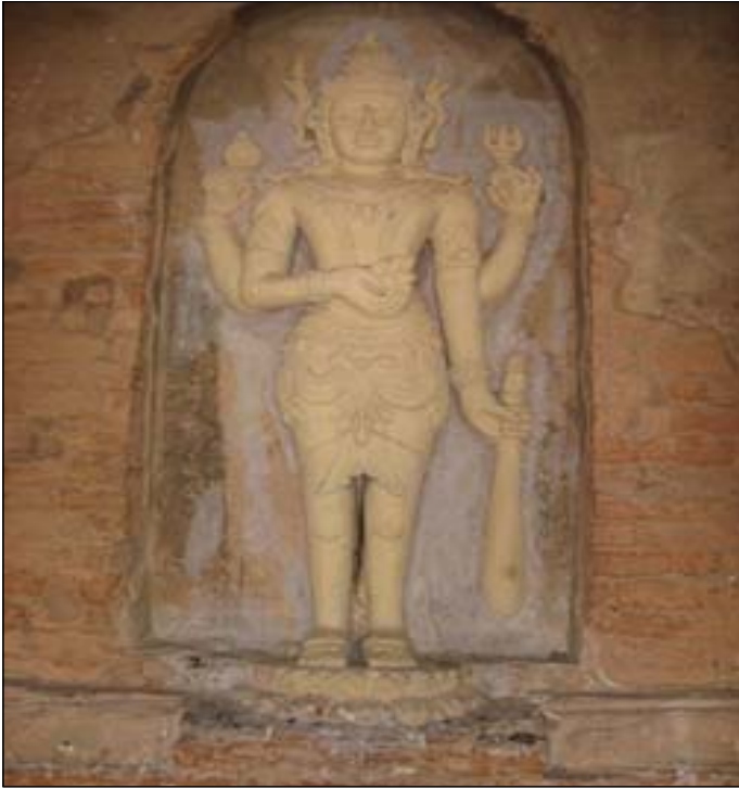
Figure 7. The Standing four-armed Vishnu at Nathlaung Kyaung

Only the inter wall of the outer corridor of the temple is left. It contains ten niches rounded at the top: four on the east side and two each on the south, west, and north sides near the corners. Their chief purpose is to house stone reliefs showing the Avataras of Vishnu, Preserver of the Universe. The series starts from the center of the eastern section, with the worshipper keeping his right side to the temple as he makes the circuit (Luce 1970: 221). According to the southern recension of the Mahābhārata , the Ten incarnations are the Fish (Representing the beginning of life), the Tortoise (Representing a human embryo just about to grow tiny legs and a huge belly), the Boar (Representing a human embryo which is almost ready), Manusiha or the Man-Lion (Representing a new born baby-hairy and cranky, bawling and full of blood—and is regarded as the greatest