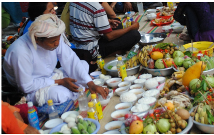
<Figure 1> Cham priest at the tower in Nha Trang, Vietnam (April, 2014).

Princess Pearl” in 1797, in exchange for “eliminating tigers” in the area. It is not clear if these “tigers” were literal, or metaphorical, but it is clear that the Vietnamese had begun their process of adapting Po Inâ Nâgar into “Thiên Y A Na.” Thiên Y A Na was interpreted by French scholars to be a Vietnamese approximation of Deviana , who, when conflated with Po Inâ Nâgar, the Daoist mother of the Fairies Xi Wang-Mu, Queen of Heaven Tian-fei and Tian Hou Sheng Mu, became very popular. Based on readings of the nineteenth century Gia Đình Nhất Thống Chí, Thiên Y A Na was even more popular than the Vietnamese goddess Liễu Hạnh from Quảng Bình province southward. Mandarin Phan Thành Giản even dedicated an 1856 inscription to “Thiên Y A Na Diển Phi Chúa Ngọc Thánh Phi” at Nha Trang. As the process of intentional conflation continued, Thiên Y A Na was later blended with Liễu Hạnh and some authors have argued for her influence on the image and worship of Bà Xứ in southern Vietnam (Po 1988: 62; Po 1989: 128-135; ĐNNTC 2012: 63-86, 125-159; Nakamura 1999: 90; Phan Khoản 2001 [1967]: 296-299,303,321; Phan An 2014; Phan Thị Yến Tuyết 2014). 21)