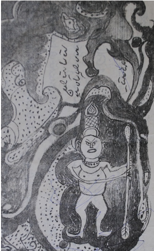
<Figure 2> Po Kuk

Ariya Mâkal lak Cam mâk Danaok padieng Po Kuk: