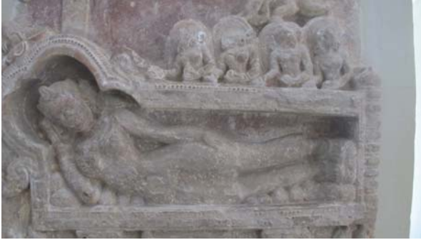
<Figure 17> The scene of Mother Maya dreaming (11 th Century)

A dream scene involving mother Maya may also be seen in Nagayon Temple. The sculpture was made of sand stone, and displays four Divas Queens posted at the feet of the sleeping mother Maya <Figure 17>.