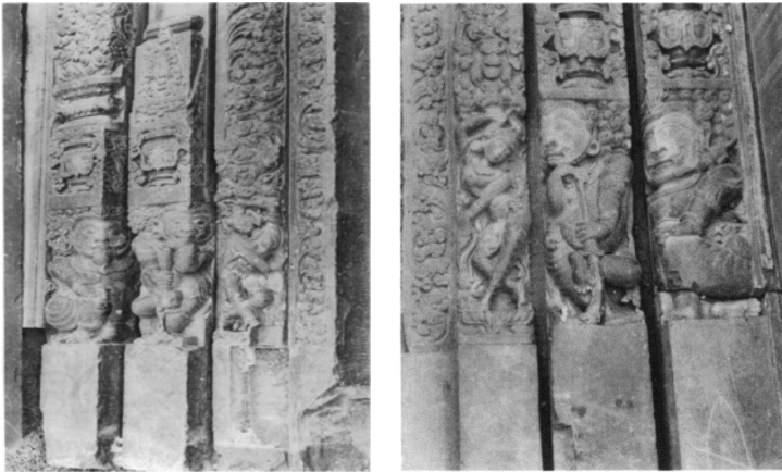
Location: At the Hindu Temple at West Bangal (Old Burma, Plate 315)

In Bagan, there was the worship of one of the Divas of Tantric faith, Parvati (the consort of the Shiva). Mahayana Buddhism regards Parvati as an important Diva. Parvati's statue