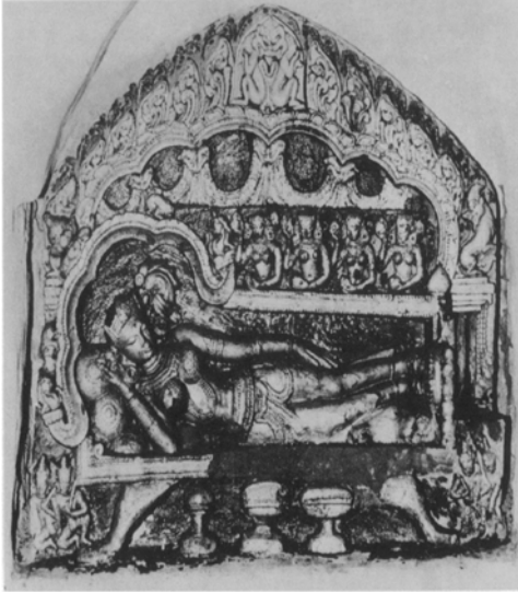
Location: AnawWatat Lake (Old Burma, Plate 278 c)

<Figure 11> The dreams of mother Maya are; Divas carrying mother Maya to Anaw Watat Lake