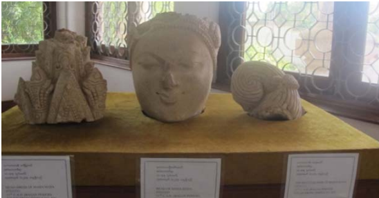
<Figure 18> Head of Mother Maya

Note: Head of Mother Maya Stucco carving found in Pagoda No. 820 from Bagan (11 th Century)