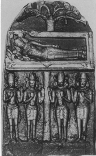
Location: AnawWatat Lake (Old Burma, Plate 306a)

<Figure 12> Mother Maya sleeping on divine bed of four Diva Queens in the golden palace