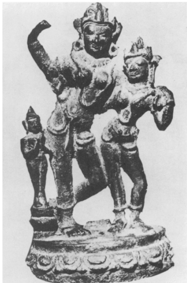
Location: AnawWatat Lake (Old Burma, Plate 433c)

The dreams of mother Maya and the scene of where she addresses King Suddhodana were to be seen in Arnanda Pagoda. The dreams include Divas carrying her Anaw Watat Lake <Figure 11>; she sleeping on a divine bed with four Diva Queens in the golden palace of Anaw Watat Lake <Figure 12>; she being carried by four Diva Queens and bathed in a suitable place at Anaw Watat Lake to cleanse her human essence <Figure 13>; and the four guardian Divas of the world guarding the royal chamber of Maya during the pregnancy to Lord Buddha <Figure 14>. In the scene where mother Maya addresses the King Suddhodana about her dreams <Figure 15> and in the scene where she tells the king that she wanted to go to Davadaha to give birth <Figure 16>, Maya's figure was depicted with a crested headdress, big ornamental ear plugs, bracelets, arm ornaments, necklaces, and waist ornaments, as in the scene of her giving birth to the Buddha. The waist ornaments were beautifully sculpted with many fringes. The Divas were also sculpted beautifully.