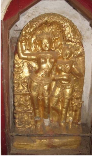
<Figure 6> The Nativity Scene

Location: Ananda Temple (Sand stone relief sculpture gilt by the later donor and pagoda trustees)