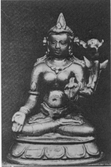
Location: Magway (Old Burma, Plate 477c)

Indian influence has definitely traversed all of Asia. It spread from as far as Bactriana, Cambodia, Japan, Java, and has also spread by way of land routes to Afghanistan, Assam, Manipur, Upper Myanmar, passing through the Himalayas to China and Tibet, where Indian cultural influences flourished (Mukerjee 1959: 27).