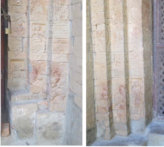
Location: Diva at the side entrance of Kyaukku Umin Cave Temple (West Jamb of Kyaukku Umin Cave Temple)