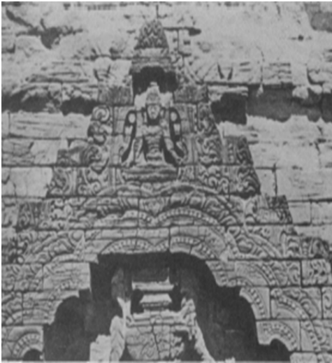
Location: on the top of the perforated stone window at Nanpaya Temple