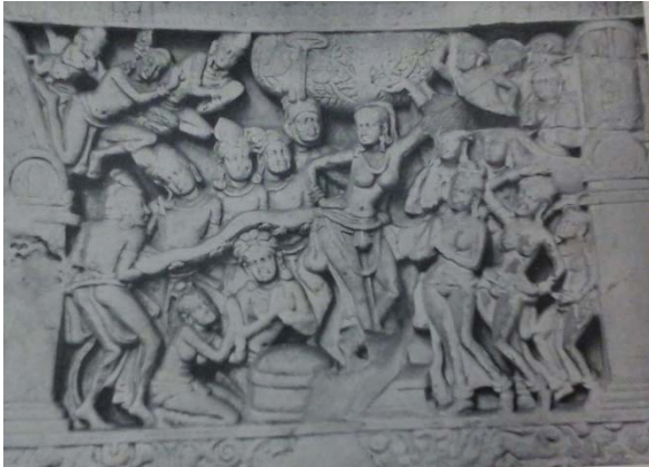
Location: Now in British Museum, London