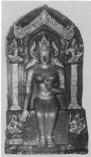
<Figure 14> Maya

Note: The four guardians Divas of the world guarding the royal chamber of mother Maya during her pregnancy for Lord Buddha (Old Burma, Plate 280a)