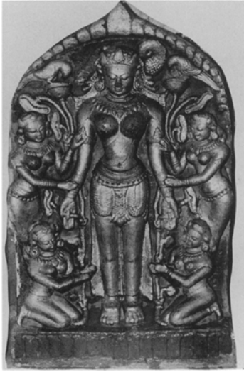
<Figure 13> Mother Maya

Note: Mother Maya was carried by four Diva Queens and was bathed in a suitable place of Anaw Watat Lake to cleanse the human essence (Old Burma, Plate 278d)