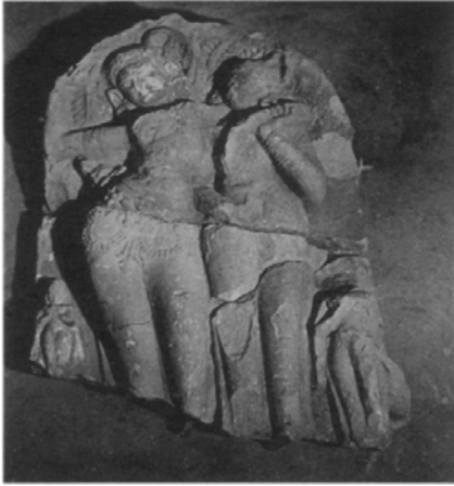
Location: Kyaukku Umin Cave Temple (Old Burma, Plate 141a)