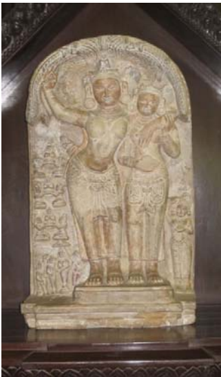
<Figure 7> Sand stone relief of the Nativity Scene

Location: Ananda Temple (Sand stone relief sculpture gilt by the later donor and pagoda trustees)