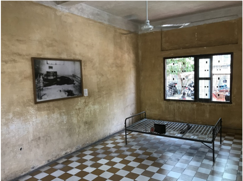
<Fig. 8> A classroom turned into a torture cell which Vietnamese soldiers discovered in January 1979.

It took about a year to set up the school-cum-torture center as a museum. As early as March 1979, the new Democratic Republic