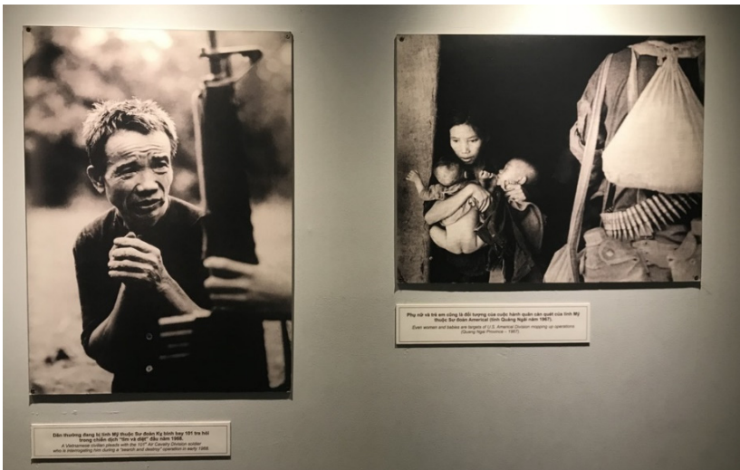
<Fig. 6> Documentary images of violence against civilians dominate the War Remnants Museum.

Possibly the most shocking display is a glass case with two dead infants preserved in formaldehyde. Both have horrible birth defects, and one child has two heads. Agent Orange’s contemporary impact on children serves as a constant reminder that the war continues to victimize the innocent. Many visitors describe viewing the photographic collection as emotionally powerful, even overwhelming. Some Americans have reacted defensively to the museum, claiming that it vilifies the American troops (Schwenkel 2009: 168-71). That