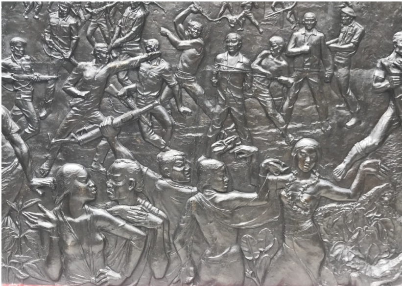
<Fig. 1> “Bad women” from Gerwani dance seductively as the generals are tortured, Monumen Sakti Pancasila.