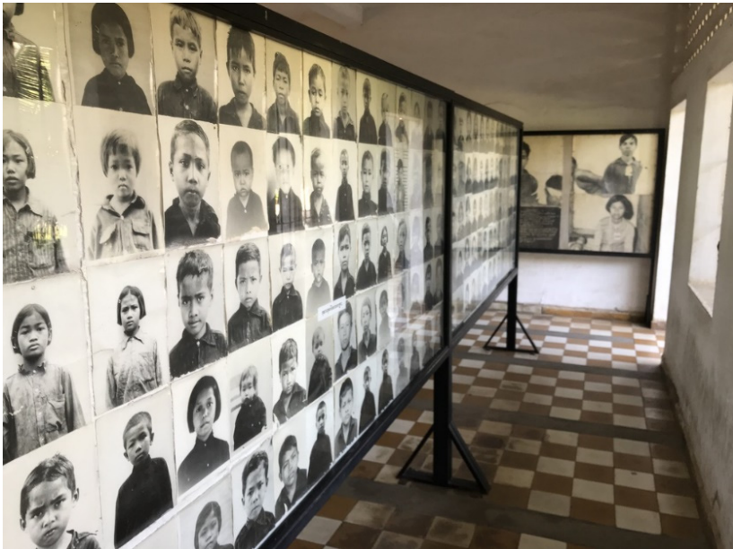
<Fig. 9> Mugshots of women and children stare at visitors in the Tuol Sleng Genocide Museum.

While David Chandler’s seminal research shows that their arrest, interrogation, and forced confessions were the product of a merciless machine obediently following the orders of a paranoid leadership, many of the faces staring out of the mugshots belonged to those who had engaged in the very revolutionary excesses the Tuol Sleng Genocide Museum was established to condemn. In many ways, the Tuol Sleng narrative of violence is ahistorical, silencing discussions of more complicated histories (Tyner 2017). Considering that in the 1990s Prime Minister Hun Sen’s Win-Win Policy used a series of amnesties to convince Khmer Rouge fighters to join his government and no small number of current state workers have a Khmer Rouge past, such calculated vagueness is understandable (perhaps even essential).