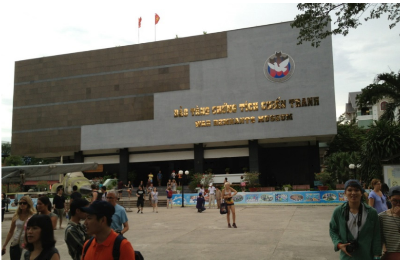
<Fig. 4> Children's art and a logo with a dove covering up falling bombs decorate the exterior of the War Remnants Museum.

Over the course of these ideological shifts, the Communist Party's museum officials have shown great thoughtfulness and sophistication