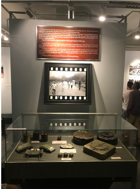
<Fig. 7> A special displays tells the story of Phan Thị Kim Phúc, the “Napalm Girl.”

said, it is impossible to dismiss the widespread suffering caused by the war. The War Remnants Museum’s emotional impact comes from its use of women and children as martyred victims of a criminal war.