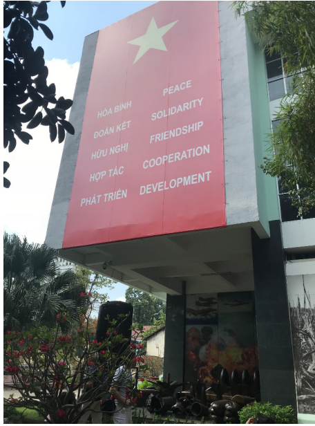
<Fig. 5> Words of peace and cooperation greet international visitors at the War Remnants Museum.

in their evolving interpretation and curation of artifacts on display and have demonstrated a clear desire to make the museum something much more important than a typical war museum. Rather than just a collection of weapons and maps of battles, the War Remnants Museum now openly promotes pacifism and even engages environmental issues. Children figure prominently in this messaging.