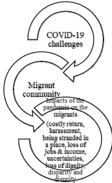
<Figure 1> COVID-19, migration and consequences.

"We are stuck here," "we are spending our time remaining at home watching movies and connecting with people via social media," were the most common responses from our respondents who are stranded in various parts of the world to our "how are you?" question. "Every two weeks, we go shopping for groceries." While governments in Southeast and East Asia are supposed to have