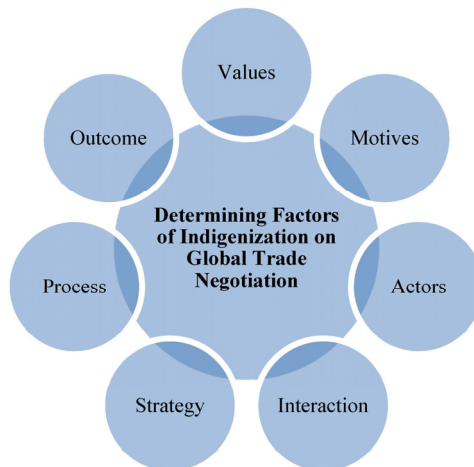
<Figure 3> Determining Factors of Indigenization on Trade Negotiation Model

This study revisits the conceptual framework in identifying trade negotiation model to measure the indigeneity of Southeast Asian automotive industry’s policy through APMRA. This study offers seven substantive variables to shape determining factors of the trade negotiation model, which include: values, motives, actors, interaction, strategy, process, and outcome. Each variable plays equally important roles in revealing the indigenous values of the negotiation model.